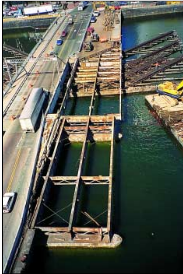
The original fascia girders of the approach spans are utilized with articulated bearings in the renovated bridge.

The original bridge was constructed over the Fort Point Channel, a tidal estuary that serves as anchorage for fishing, shellfishing and lobstering vessels, as well as pleasure boats and rowing shells. The surround-