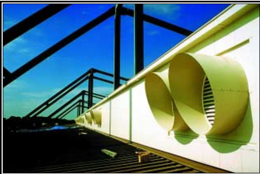
Among the interesting design features are circular louvers, which were chosen to enhance the nautical theme at the naval base.

with STAAD-III software from Research Engineers. The concepts were graded against each other using a comparative system analysis that quantified the following: erection time; weight of steel per sq. ft.; response to hangar door deflection criteria (upward and downward deflections); height of building envelope; area of building surface; ability to resist large-scale horizontal torsion stresses due to design wind forces; and foundation resistance requirements for gravity, uplift and horizontal forces.