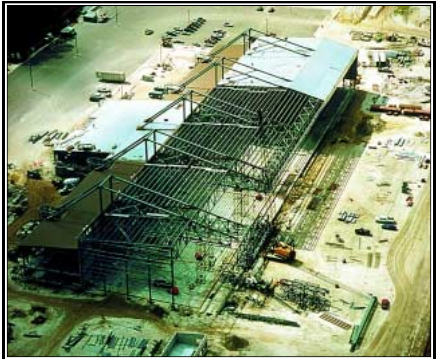
Large trusses were used to create a clearspan of 500' x 135' to accommodate five anti-submarine aircraft in a new hangar at the Jacksonville Naval Air Station.

The alternate concepts were analyzed using three-dimensional computer models operating