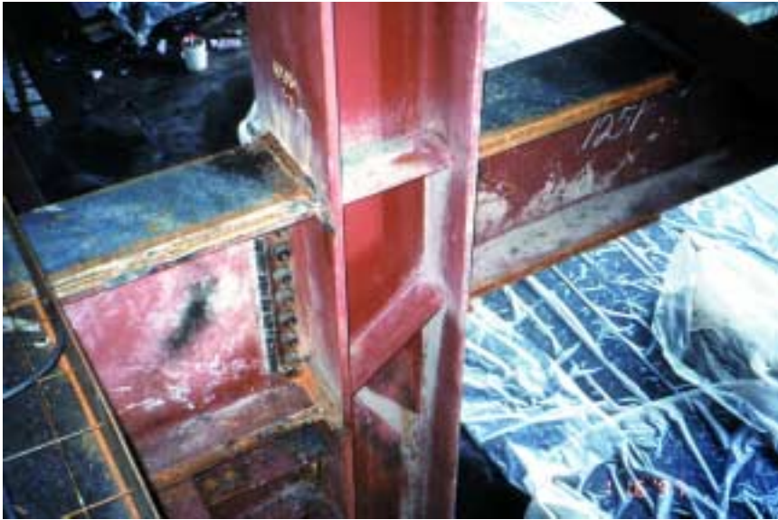
Truss bottom chord drag strut connection

would be expected). This presents additional design challenges in detailing intersecting beam connections to provide adequate bracing. Collecting bracing loads and accounting for ceiling system seismic bracing forces need special consideration since interstitial framing levels are not continuous by means of a structural diaphragm. Loads must ultimately be transferred to a rigid diaphragm for redistribution to braced frame members.