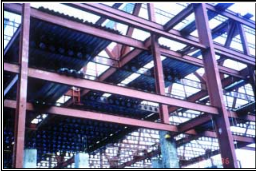
Three levels of structural framing showing "Fan Deck" and roof framing with open-web expanded beam framing.