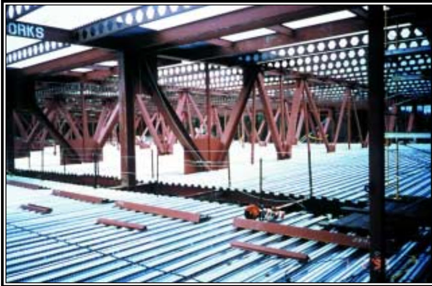
"Fan Deck" long span truss bay with open-web expanded beam roof framing

umn and beam sections. Heavy structure loads would increase the number of frames required to limit member sizes and control building drift. The complexity of post Northridge moment connection field welding has recently created schedule problems on fast track projects not only due to increased field welding but also as a result of more stringent inspection criteria. Further, considerable ongoing review and testing of moment frame connections continually produce new information regarding design, detailing, and material specification requirements.