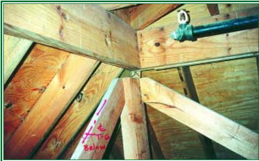
Note the large separation in the roof framing.

forcement would be necessary. In 1995, we were called back to the site by Charles Porter of the architectural firm of Coblin Porter Associates to examine some new drywall cracks in the walls of two light wells—with some of the cracks exceeding 1" in width.