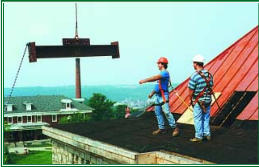
Pictured is a close-up view of a truss member as it is transported to the interior of the structure.

was rejected early because of the limited space around the building, building accessibility and high risk for rainstorm damage.