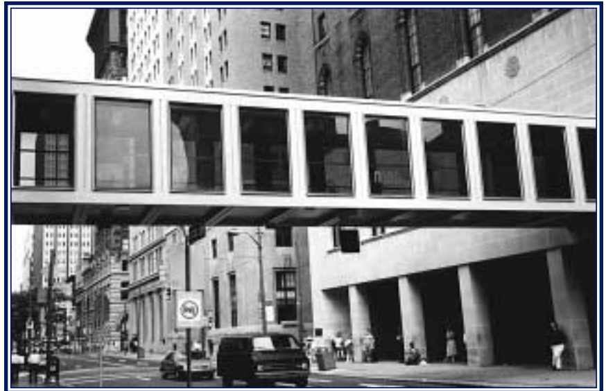
Point Park College Pedestrian Walkway in Pittsburgh is a good example of a Vierendeel truss.