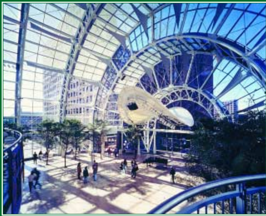
The dome takes its shape from a steel-framed skylight consisting of a series of circular arch trusses with pipe section chords and tie rod diagonals. The chords of each truss converge to a single pipe column ringing the perimeter of the Artsgarden space.