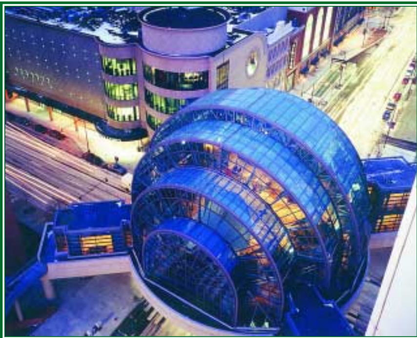
The Artsgarden is the central civic element in a city that boasts many remarkable public spaces. This nighttime photo shows the headlights of traffic flowing under the Artsgarden. Note the sloped glass at the base of the smallest arch, which creates a more circular floorplan.