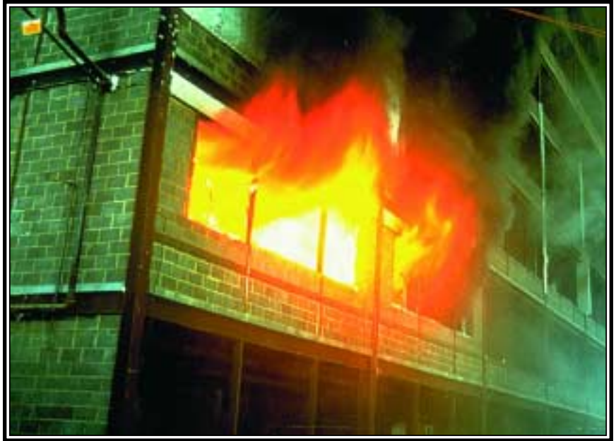
A variety of tests were carefully monitored in the Cardington test facility.

One of the first indications that real structures might behave differently from single members in standard fire tests came when a test was carried out on a simulation of the Liverpool Hospital roof back in 1978. The natural fire test was done in a large rig of 300m 2 (20 × 15m) inside which was a fire compartment of 42m 2 (6 × 7m) connected by open doors to the larger volume. The roof comprised one-way spanning beams of 254 × 146 × 31kg/m with lateral purlins supporting 1.8 hectares of roof decking. The fire load was very high at 95kg/m 2 giving a heat output of 15MW and a fire temperature of 1100°C. A partial collapse of the