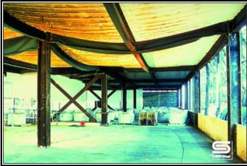
A sustained fire caused distortion but no collapse.