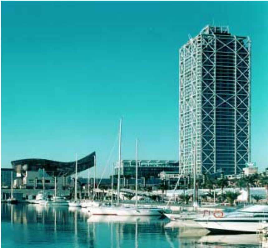
The Hotel del las Artes at Vila Olimpica in Barcelona, Spain expressed many of Iyengar's design philosophies.

tallest building at that time – reached completion three years later. The landmark skyscrapers, like many of Iyengar's works, have been praised for being highly innovative, yet practical.