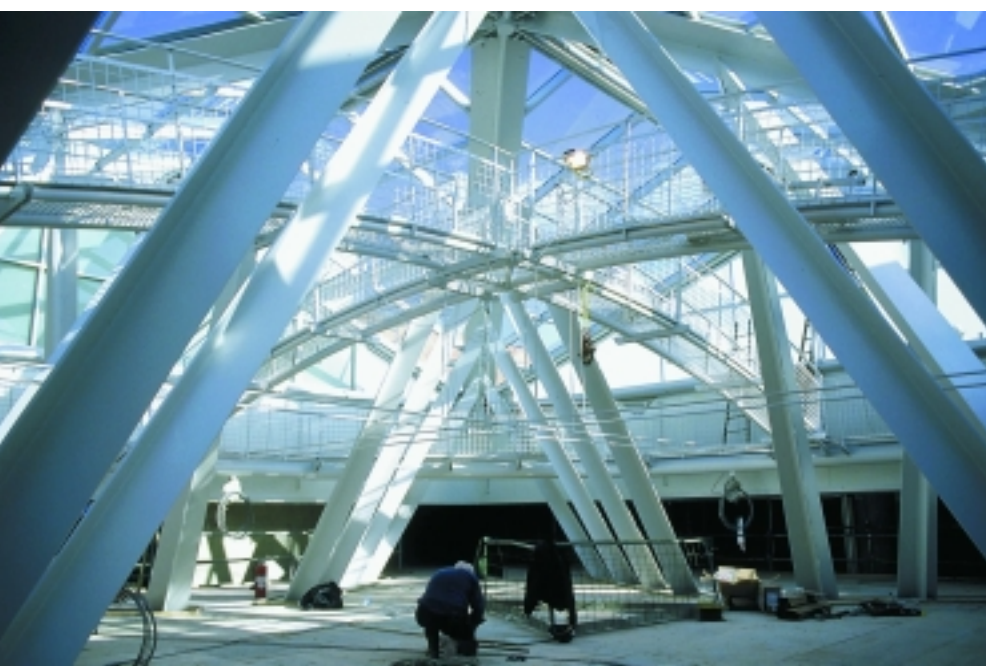
View of erected structural steel roof from a construction platform.

carried out by using ETABS software produced by Computers & Structures Inc. integrated with Autodesk AutoCAD drafting software by the use of a program developed by Yolles Partnership Inc. This software permitted the design team to satisfy itself in both the structural design characteristics of the structure and a three dimensional aesthetic of the proposed structures.