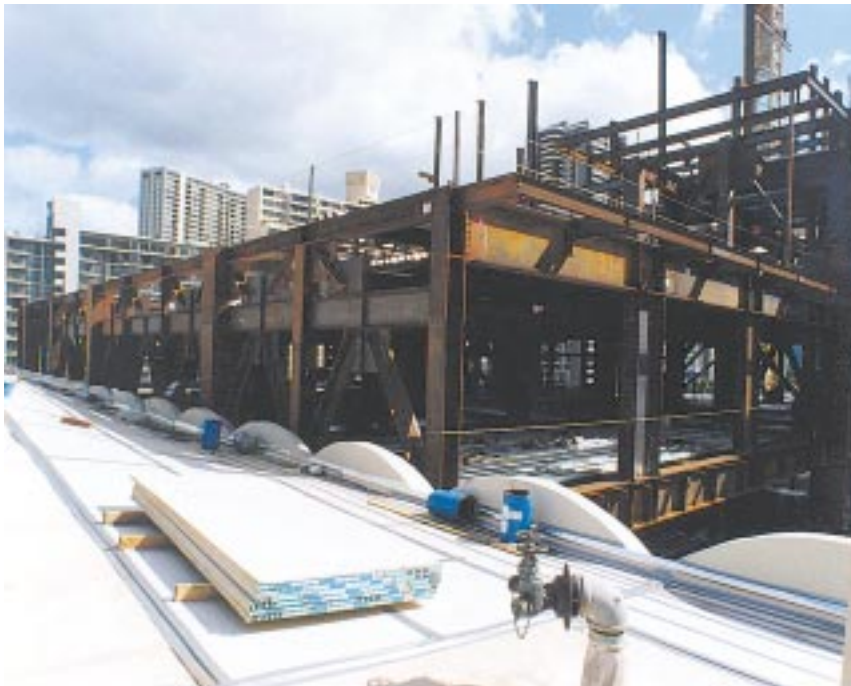
Long-span framing of the pool deck, spa and conference center.

Coordination requirements included: blockouts for the erected steel columns, embedded electrical conduits with precisely located stub-outs, balcony slopes and curbs, drain/downspout and plumbing riser blockouts, blockouts and inserts for the welded connections to the steel frame, connections between the planks, and inserts for doweling into the adjacent cast-in-place and steel decked portion of the diaphragm. This central cast-in-place diaphragm in the guestroom bathrooms, corridors and service core provided shear transfer to the collector beams and to the lateral-load-resisting braced frames. A poured concrete diaphragm or cast-in-place concrete topped chord element is associated