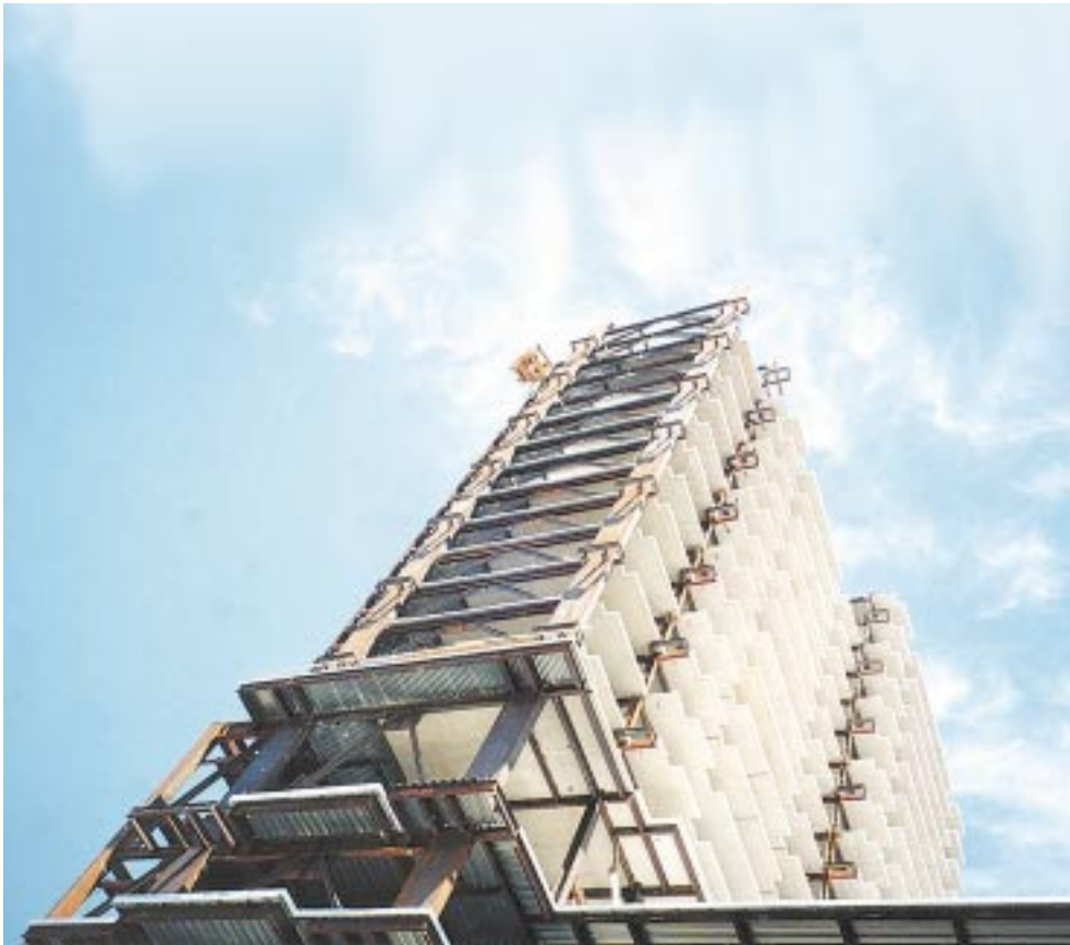
The integrated erection of structural steel with precast slabs resulted in a net savings of five to six months in construction schedule.

with connectivity to all lateral load resisting elements.