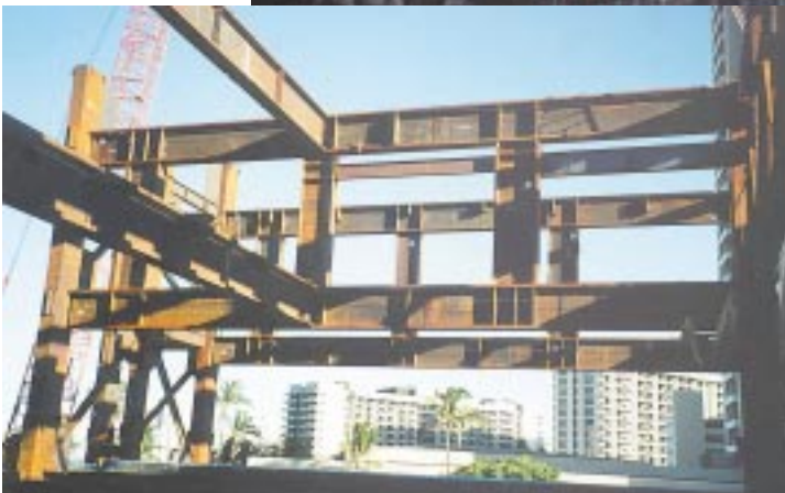
One-story-tall Vierendeel trusses span three floors over a 60' wide access road.

(top) Kalia Tower commands the most prominent entrance to the Hilton Hawaiian Village Beach Resort and Spa in Waikiki.