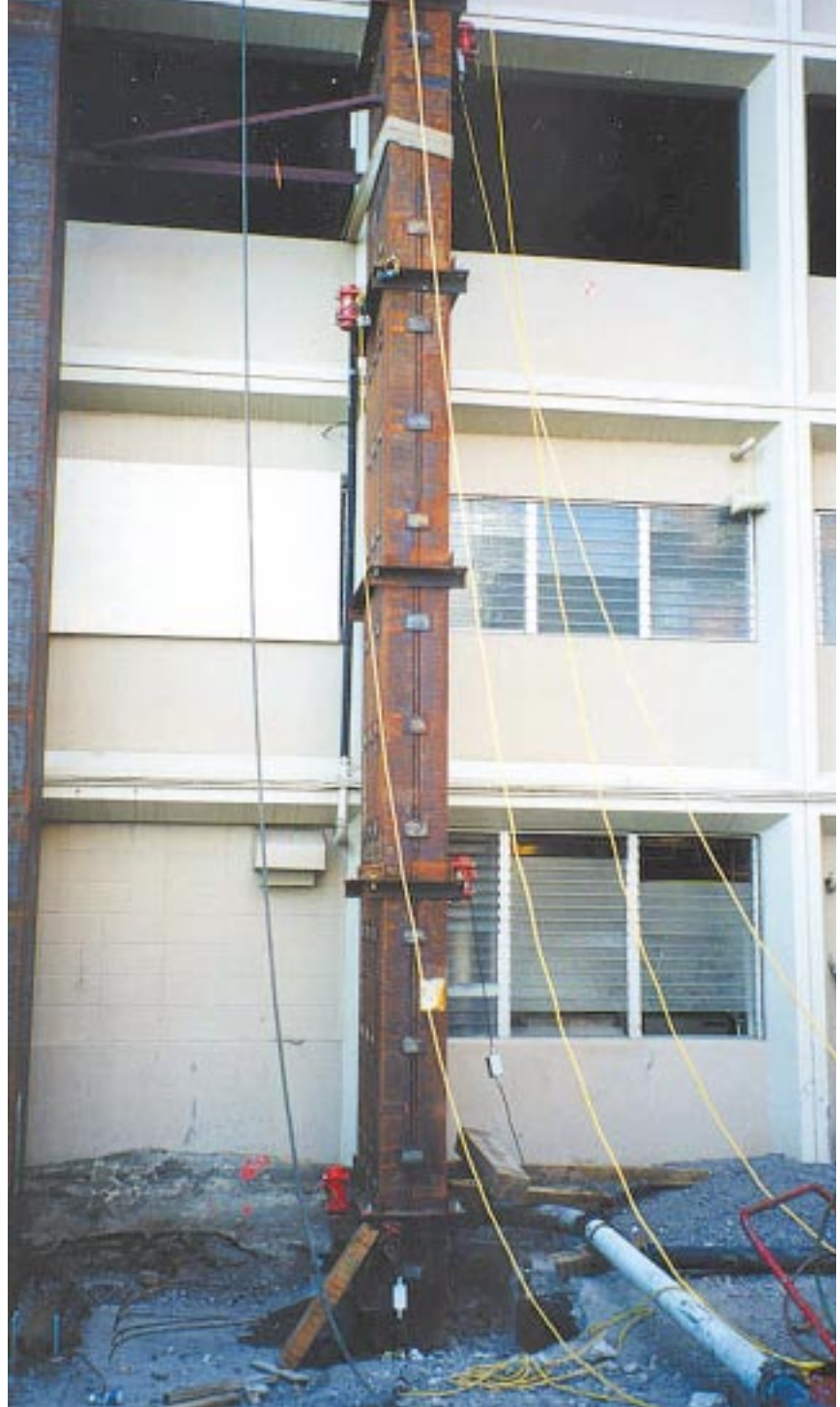
A multi-story pumping test of a concrete-filled tube. The mock-up was then dissected and inspected.

Designed by the internationally-recognized architectural firm of Wimberly Allison Tong & Goo, the site imposed significant challenges. One of the most obvious design issues was the view-blocking potential of the adjacent 100' tall Mid-Pacific Conference Center and parking structure, situated on the ocean-facing side of the building site. The challenge was converted into a functional advantage by creating a 2-story bridge from the tower to the conference facilities at a height of 40' above the entrance roadway. The con-