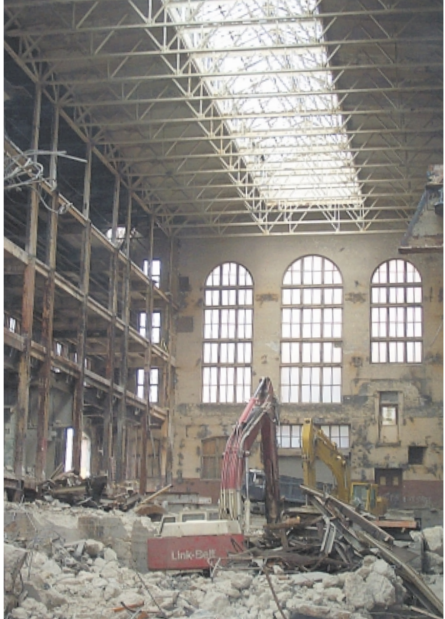
Removal of the large concrete masses, which used to support the electric generators inside the power plant, makes room for the new office spaces.

The new steel columns in the east bay were supported on the existing