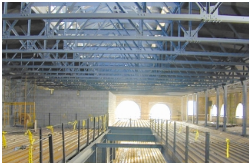
New steel framing at the fourth level is sheltered under the existing 98-year-old steel roof trusses.