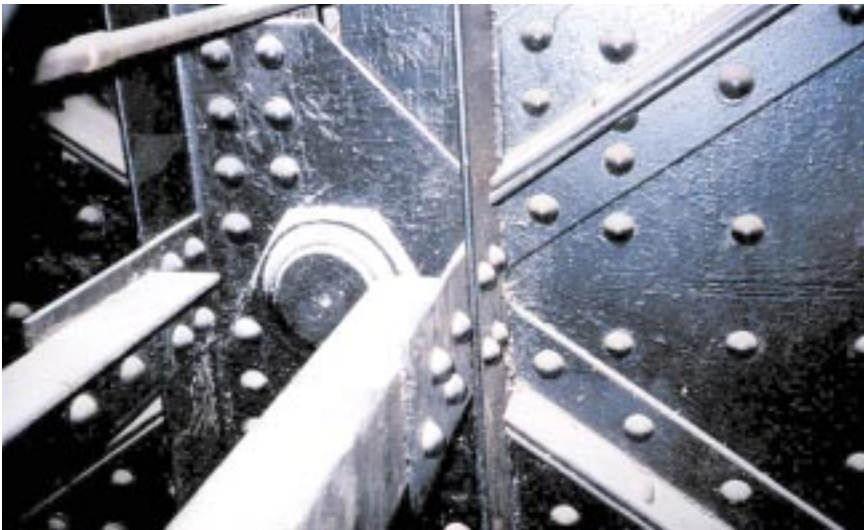
View of the center hinge connection for a typical roof truss.