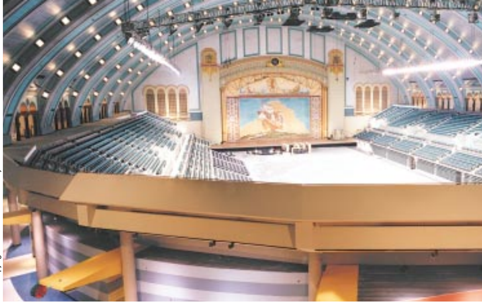
The completed Boardwalk Hall Auditorium with new precast seating bowl, new lighting, pulley-operated scoreboard and original stage and proscenium finishes.