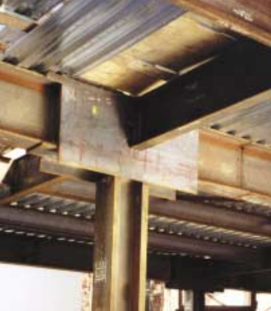
View of a typical SidePlate connection.

time frame, complete design and cost estimates could not be performed.