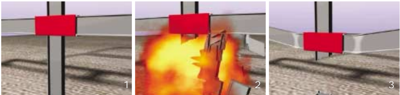
This sequence of images shows the theoretical behavior of a moment connection when a column is removed from the frame.

modified and reinforced to accommodate new requirements. Concrete structures are more difficult and costly to modify or strengthen.