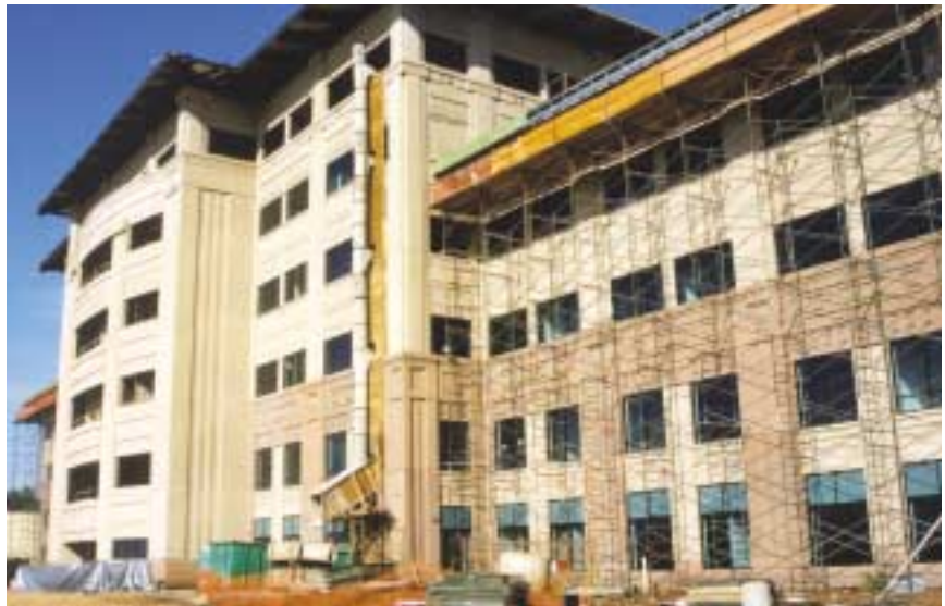
Below: Exterior of the Pacific Command Center.

ating carefully with all the design team members.