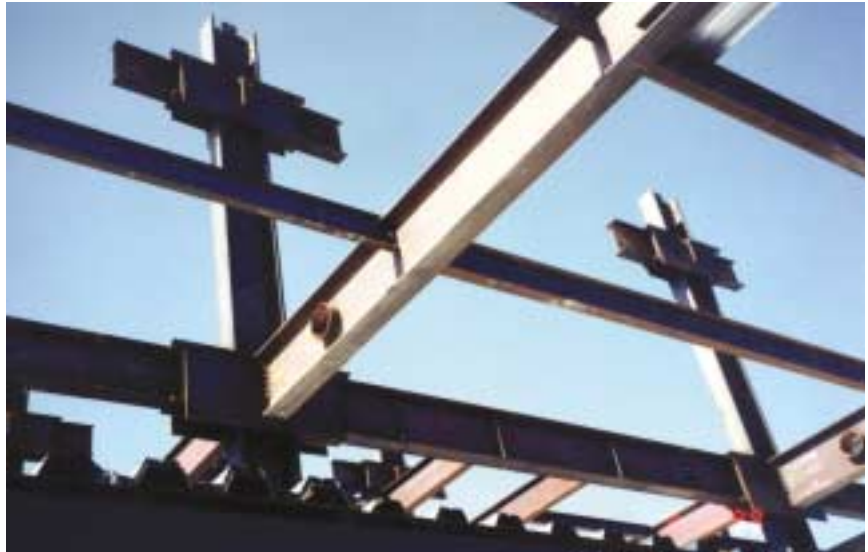
Above: Moment connections using SidePlate technology were shipped to the site fully assembled.

The original three-dimensional model of the structure was modified in RAM Structural System. The electronic files were exchanged between different team players to facilitate the analysis of this option in the short time frame provided. The resulting design can be compared to a light conventional steel frame structure with an efficient structural steel frame weight of less than 10 psf. This innovative solution was made possible by creatively exploring cost-saving alternatives and communi-