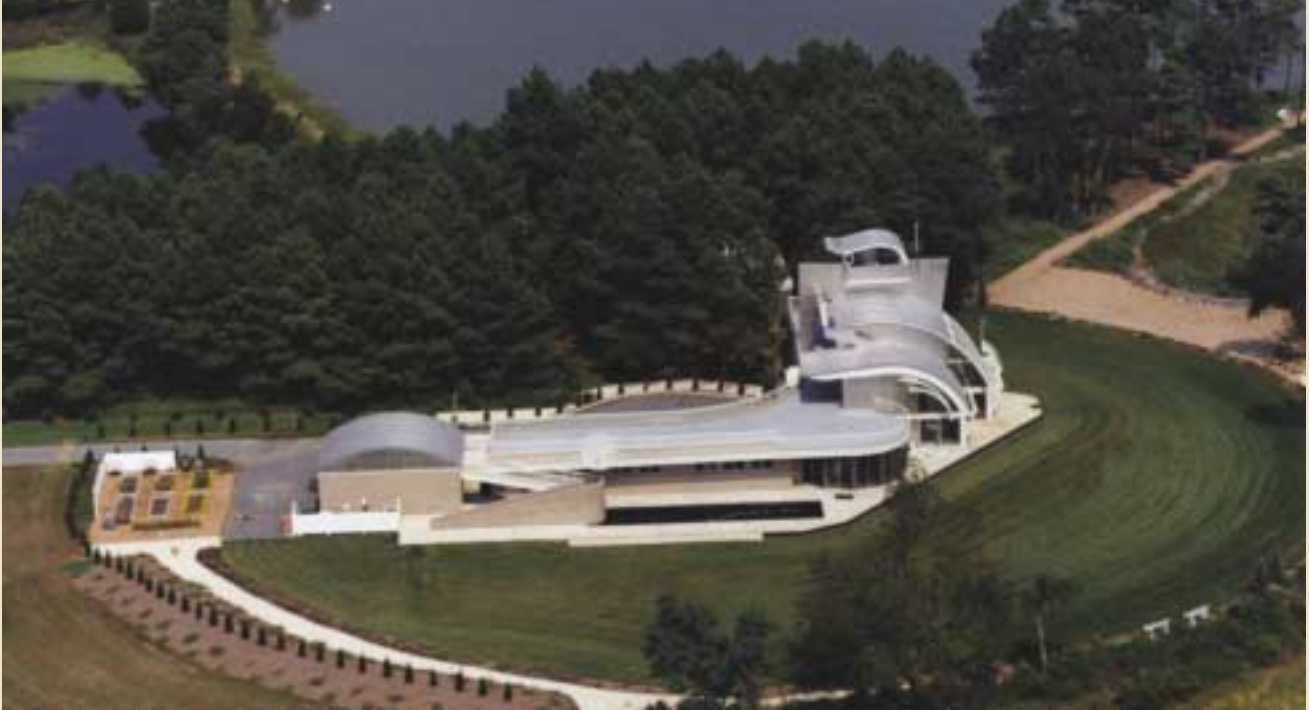
The residence is located on Benoni Point, a point of land at the confluence of two major rivers leading to the Chesapeake Bay.

winds build up their strength over water and weaken over land, where their main punch occurs.