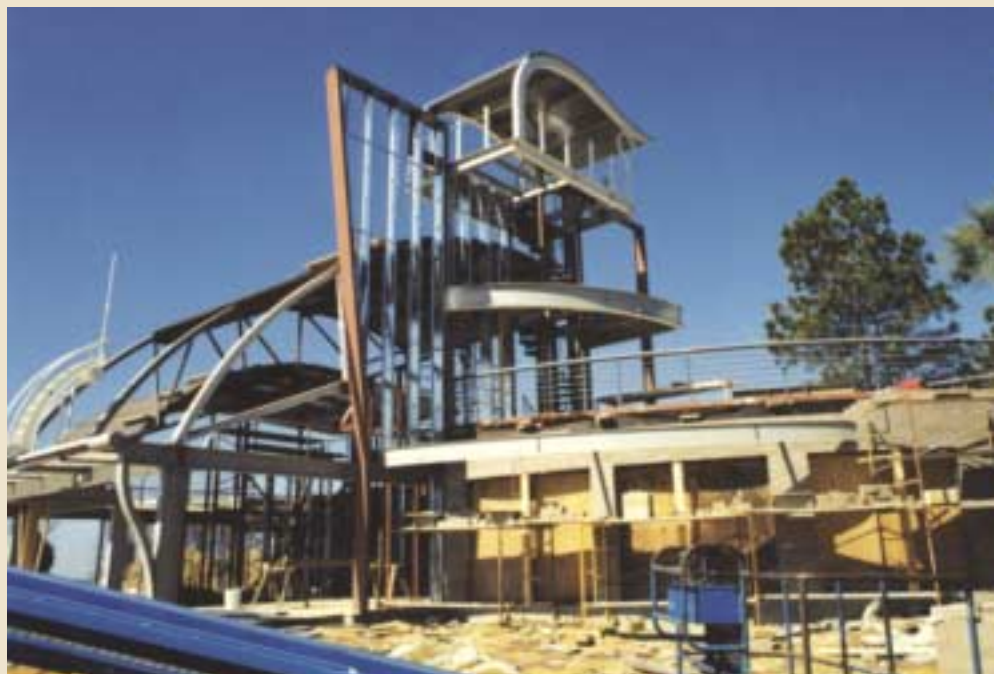
Channels and W-shapes formed into aerodynamic curves contribute strength, stiffness and architectural interest.

The steel framing begins with 12×26 wide-flange columns set so that their webs are parallel to the wind force. These stout columns support the custom-shaped beams and the bowstring trusses that give shape to the vaults.