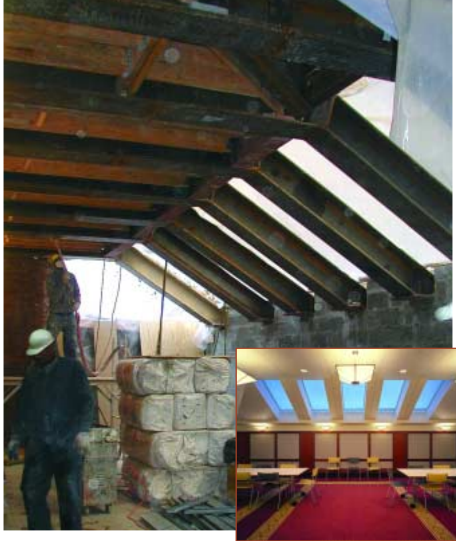
Above: New steel framing supports five floors above—and a masonry bearing wall—to provide column-free space and skylights for the new ground floor Commons Room (inset).

The greatest design challenge involved the introduction of modern utilitarian elements—fire stairs, elevators, lockers, science and computer classrooms—into a building that the client chose for its Beaux-Arts interiors. The architect developed a two-tiered approach. The team identified the most historically valuable and best-preserved original rooms, and assigned to them "soft" new uses, such as homerooms, the reception room, and the library. These rooms underwent a restoration, received compatible lighting fixtures, and their new infrastructure was concealed.