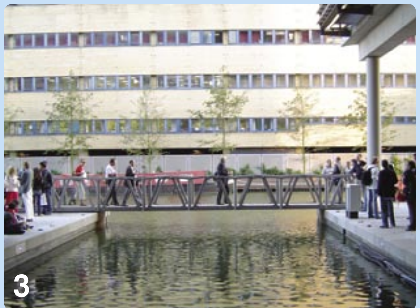
Figures 1, 2, and 3 show the sequence of the bridge unrolling after being opened to allow passage through the canal.