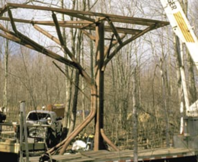
Three different round sections were used to create the steel branches of the tree.