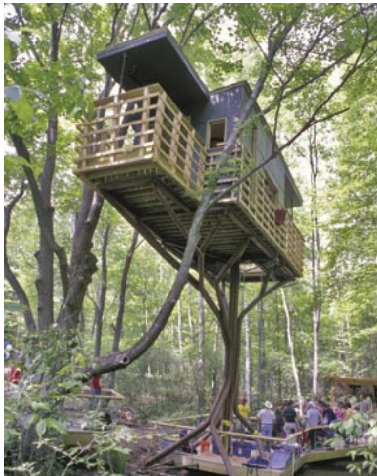
Because of poor soil conditions at the site, the tree branches downward (as well as upward) to counteract the eccentric loading of the tree house.

University of Michigan C.S. Mott Children's Hospital, Ann Arbor, MI