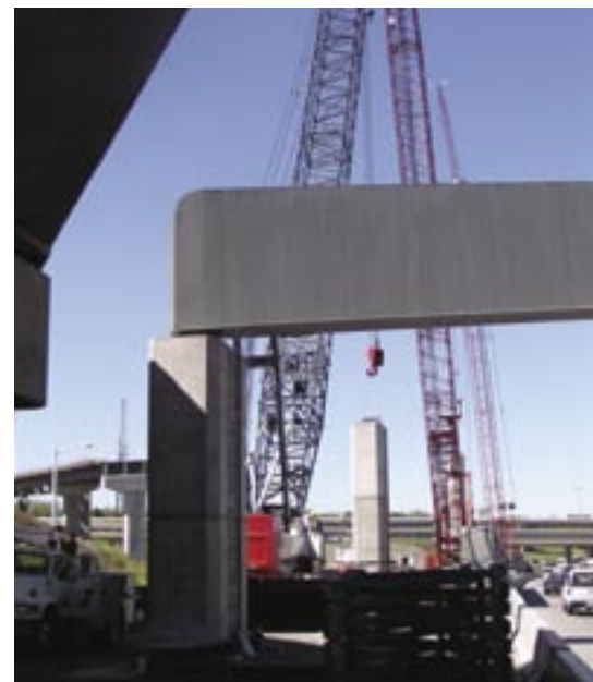
Steel cap beams facilitated erection. In some cases, these cap beams spanned up to 180' while carrying six lanes of traffic.

This four-lane highway, which passes underneath most of the bridges, required dropping of a lane in each direction for specified weekend closures. All lanes remained open during the work week. A construction sequence was specified on the bridge plans that showed the specific order of erection of the girder segments and steel cap beams. Typically, the erection sequence specified that the cap beam would be placed atop the columns and