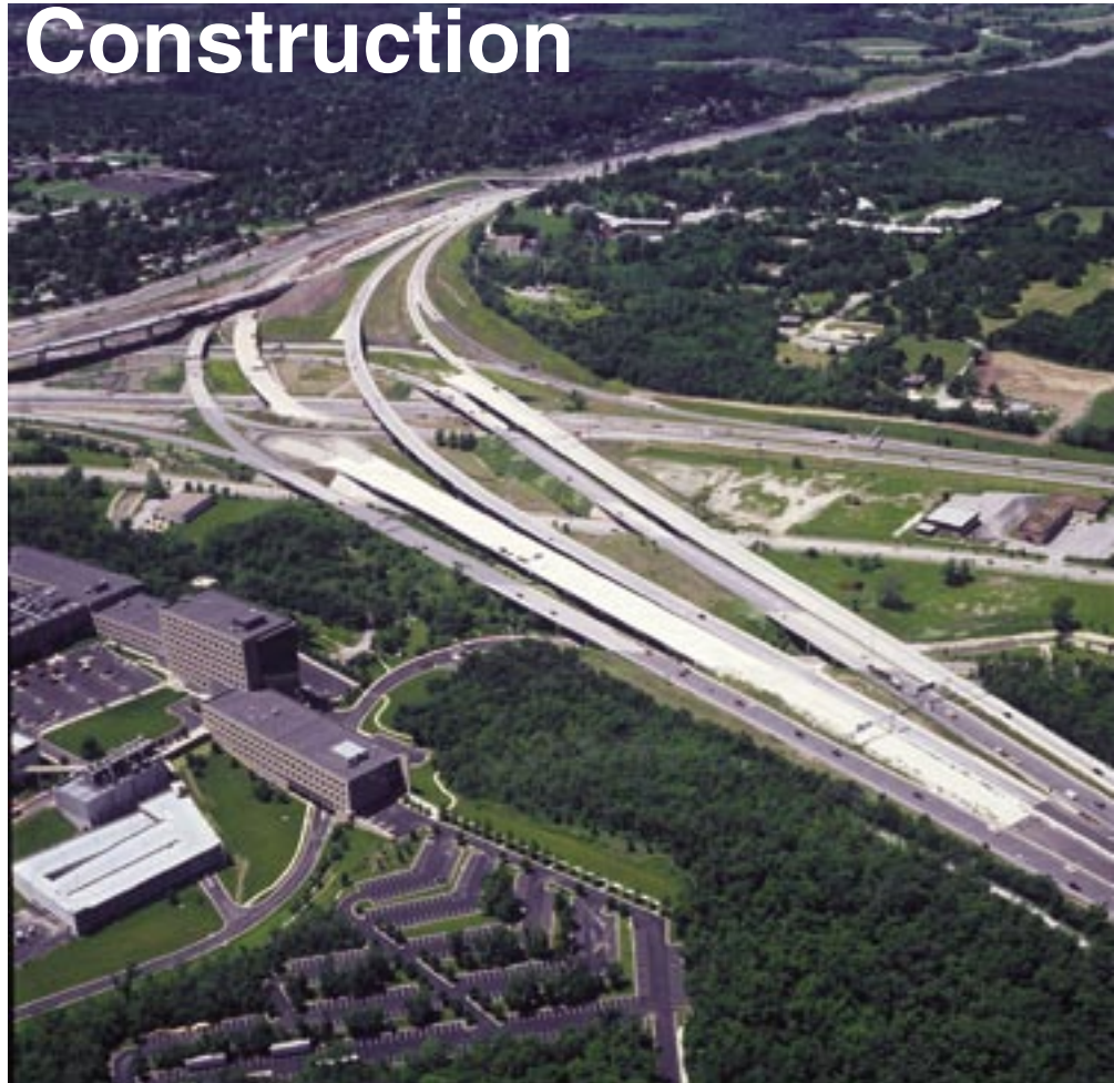
The Triangle interchange carried 250,000 vehicles daily as it interconnects two interstate highways, a four-lane U.S. highway, two creeks, and several main thoroughfares in Kansas City, MO.

The project also encompassed the daunting task of increasing capacity for the interchange—already handling two interstate highways, a four-lane U.S. highway, two creeks, and several main thoroughfares—without reducing capacity during construction. MoDOT mandated that rush hour traffic could not be affected over the course of the expected eight years of construction. The mandate also required that the normal number of driving lanes be available to commut-