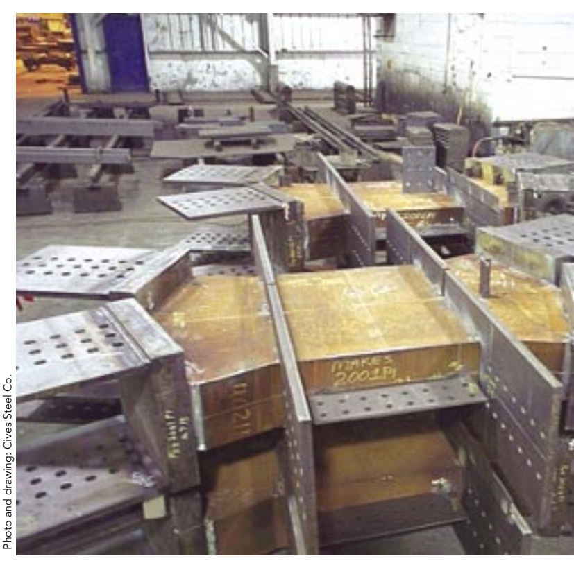
JULY 2006 MODERN STEEL CONSTRUCTION

Ron Tuttle: We did the connection design out of our office in Atlanta, and we also did some of the design out of the office