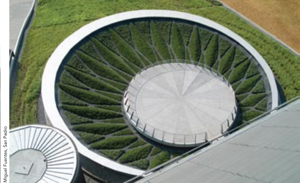
Miguel Fuentes, San Pedro

transported to the site. After installation of the columns as well as the outer ring walls, large segments of the roof were lifted into place and then site-welded into a monolithic folded surface.