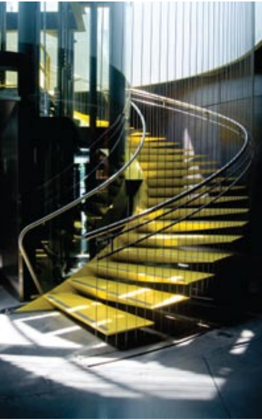
Miguel Fuentes, San Pedro

Below: Helical stair with cantilevered treads and pre-stressed cables.