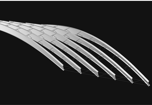
Skewed beam geometry, before deck pouring.