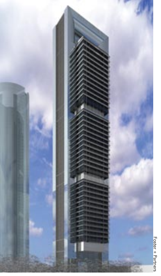
Caja Madrid Tower, at 820 ft, is the tallest building in Spain.

the cores. As the cores try to resist the thrust and move outward, away from the floor plate, tension forces are introduced into the floor framing members on multiple floors above and below the truss bottom chord levels. In essence, the floor framing above and below the truss levels is trying to hold the cores together as the thrust from the trusses tries to push the cores apart, which was an undesirable design solution. To eliminate the trusses' thrust against the cores, post-tensioning tendons are provided along the bottom chord of the primary truss and anchored to an embedded column in the cores. In addition to minimizing the axial thrust on the core, the post-tensioning provides a level of redundancy for the connection of the bottom chord truss to the core.