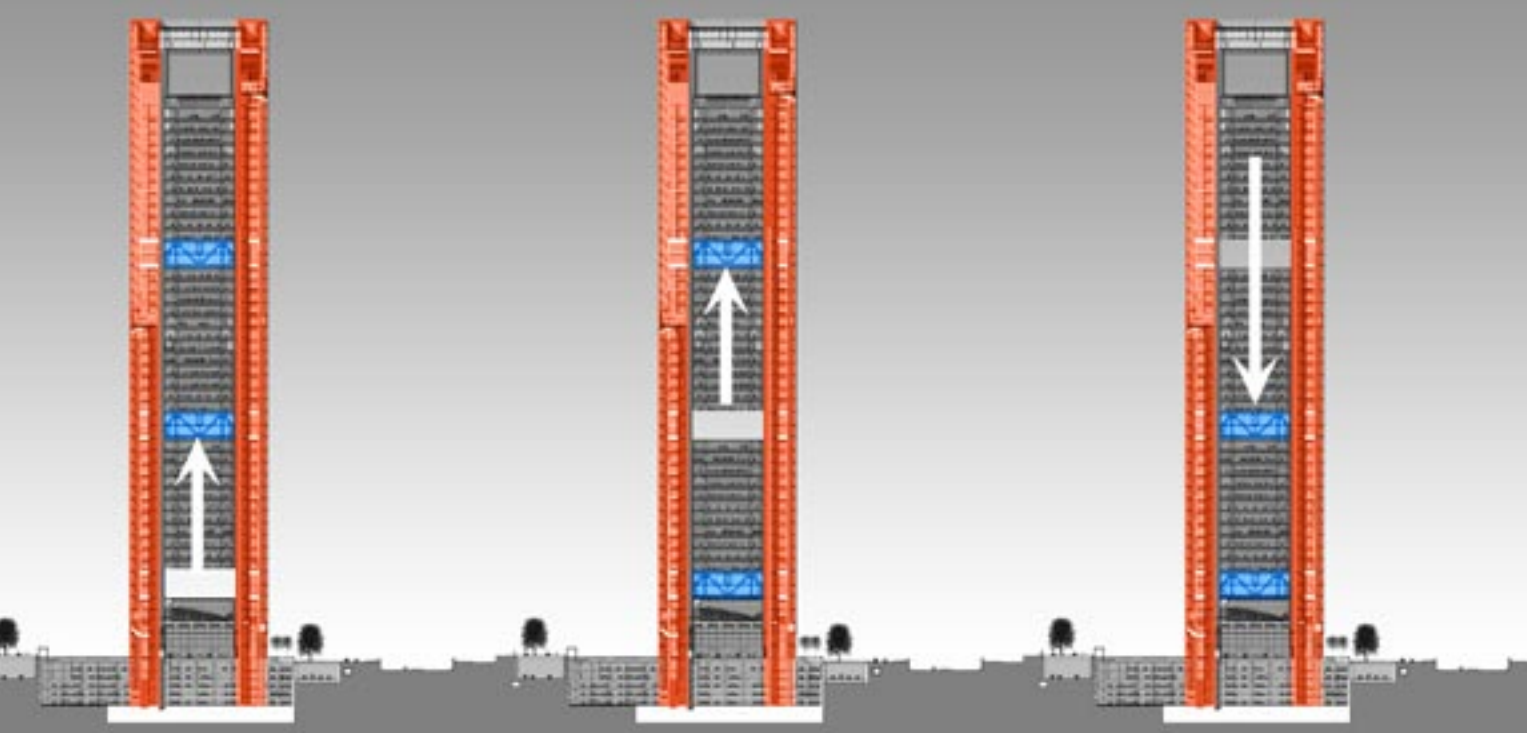
MODERN STEEL CONSTRUCTION JULY 2009

The typical office floor plate, about 14,530 sq. ft, is framed in structural steel and is unique in that the four corners of the floor cantilever roughly 271/2 ft from the core and 23 ft from the nearest exterior column through the use of an aesthetically light