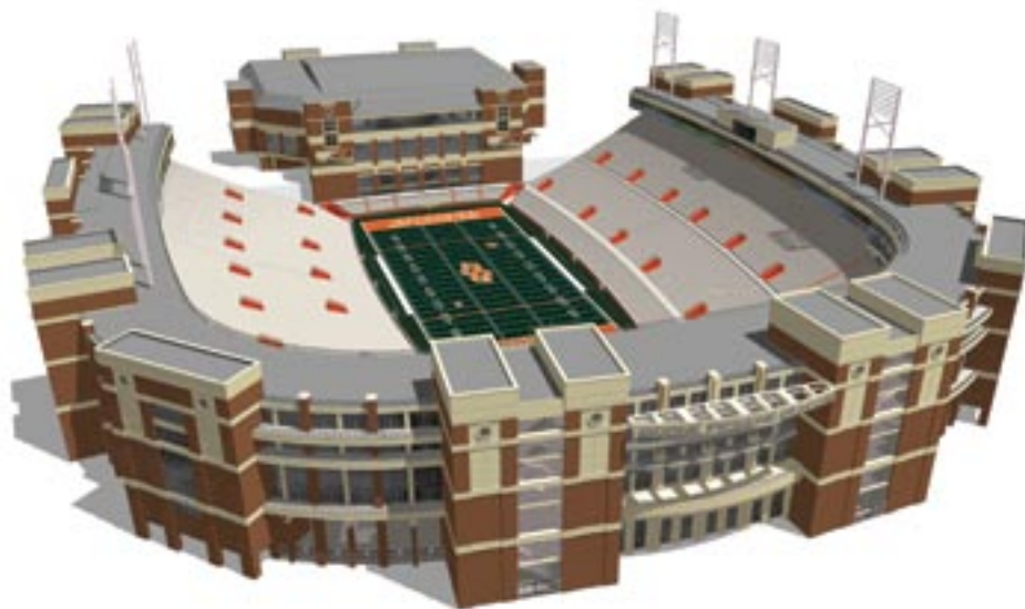
SPARKS Sports, a division of Crafton Tull Sparks

The cantilever emerges over the existing south grandstand.