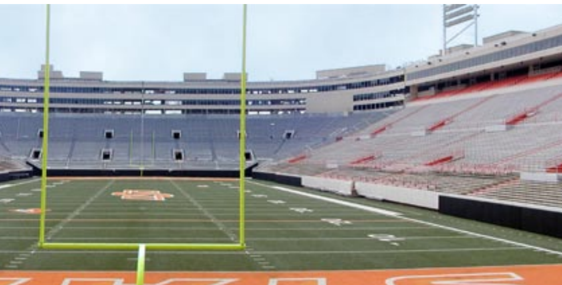
WALTER P MOORE

The new Mezzanine Level immediately above the Plaza (ground) Level services the upper grandstands and accesses 21 new two-story concession and restroom buildings. At the existing grandstands, 14 of the concession and restroom buildings were constructed within the existing web of steel framing. A new steel-framed floor, optimized with W16 and W18 beams, was installed to create the Mezzanine Level concourse and Roof Level of the concession and restroom buildings. The steel framing was conveniently attached to the existing steel frame with shear tab steel connections and allowed for nominal strengthening of the existing foundations below. Addition-