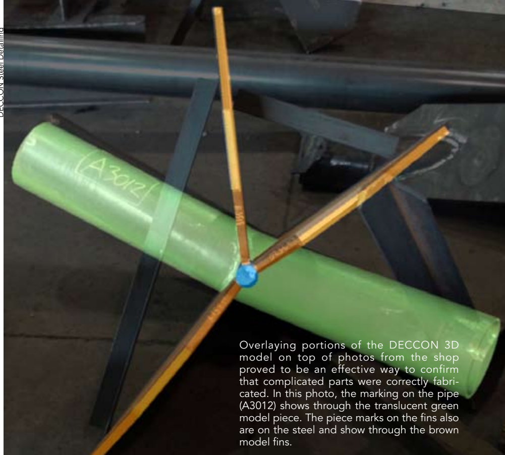
Overlaying portions of the DECCON 3D model on top of photos from the shop proved to be an effective way to confirm that complicated parts were correctly fabricated. In this photo, the marking on the pipe (A3012) shows through the translucent green model piece. The piece marks on the fins also are on the steel and show through the brown model fins.

The strategy was to erect the entire frame loosely with erection tabs/bolts that