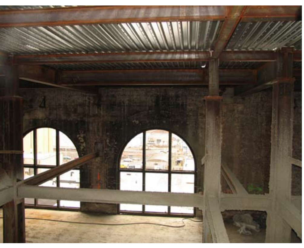
Additional steel framing facilitated the development of individual condominium units inside the old power generation station.