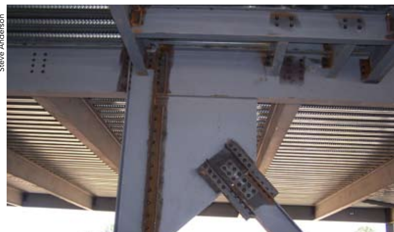
Fig. 2B: During an earthquake, conventional braces typically generate larger maximum forces than buckling-restrained braces, so their connections are much larger.