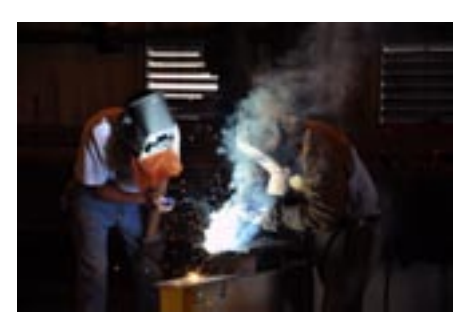
▲ Learn. An inspector uses a stopwatch to measure the welding speed per single pass of a new weld procedure. The photo was taken in Herrick Corporation's Stockton, Calif., shop.

Scheduled to launch on November 1, 2010, the website address is www. atcouncil.org/windspeed.