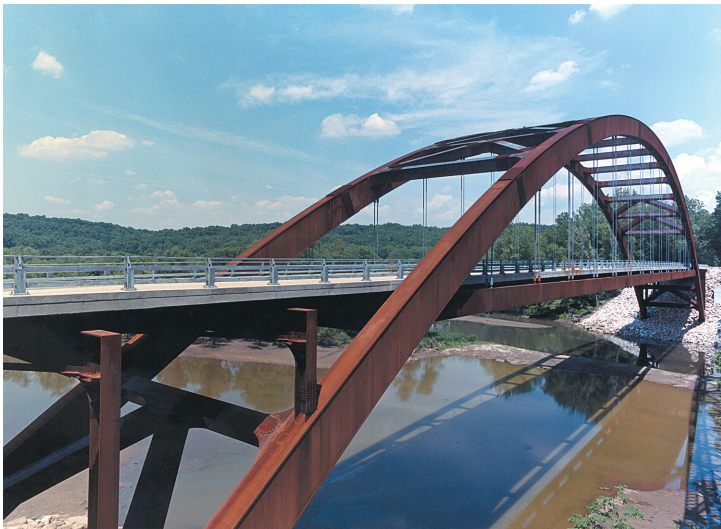
▲ 2001 Prize Bridge Award—Long Span: The Paper Mill Road Bridge in Baltimore County, Md., features a steel box arch.