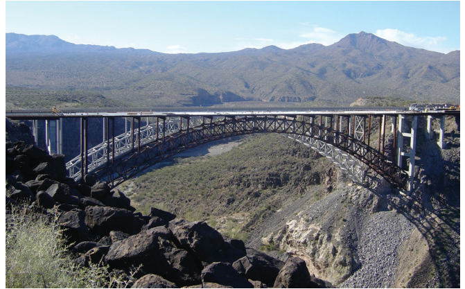
▲ 2007 Prize Bridge Award—Major Span: The Burro Creek Bridge on U.S. 93 between Phoenix and Las Vegas.

Members of the general public will vote online for their favorite bridges. The pool of candidates will include all of the prize-winning bridges recognized since the inception of the Prize Bridge Competition.