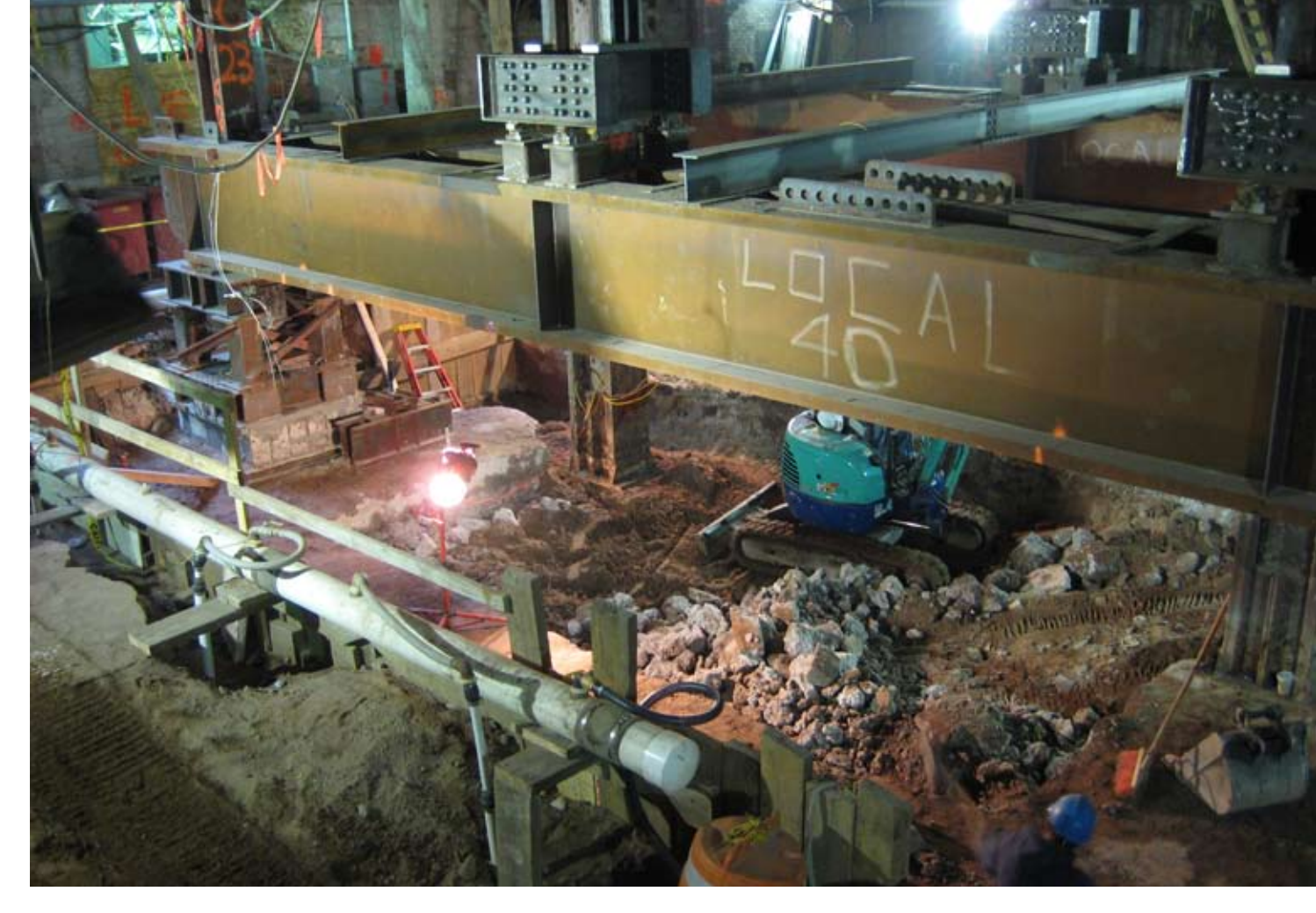
After the jacking process relieved the load on the interior columns, the existing foundation in that area was demolished and replaced with a larger, deeper mat foundation.

ings below. In total, eight columns were needed for this redistribution and load transfer process.