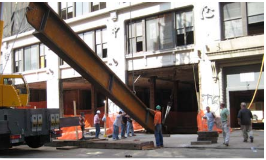
One of four 44-in.-deep, 50-ksi built-up steel plate girders with 3½-in.-thick flanges being lowered into the basement. The girders transferred column loads of as much as 900 kips and facilitated a foundation replacement under existing columns.