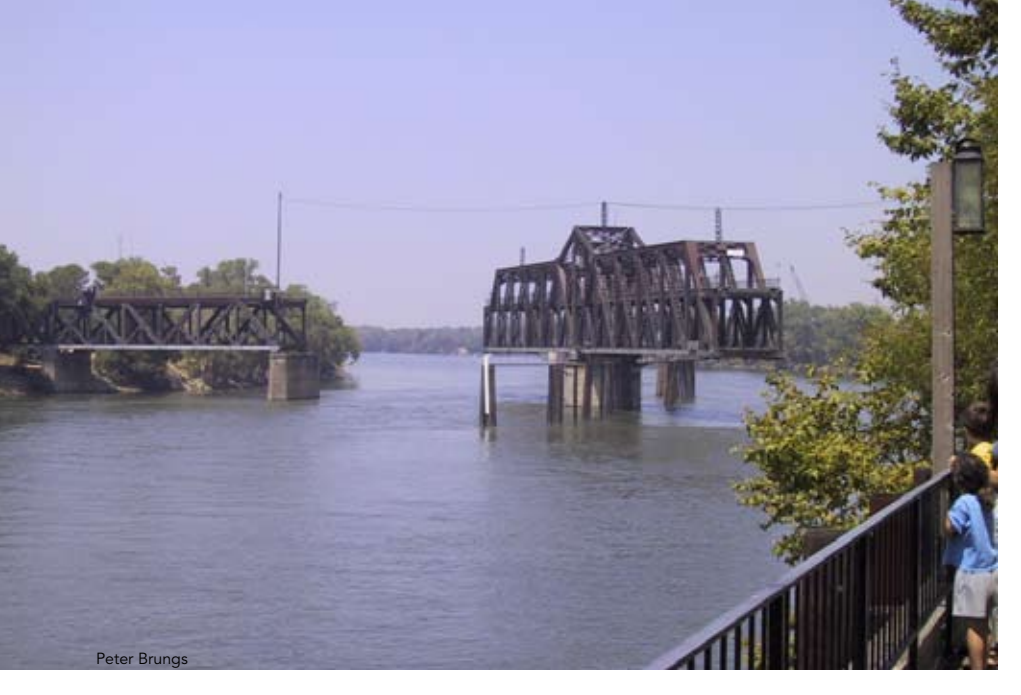
▲ Supported by a 42-ft-diameter pivot pier in the Sacramento River, the 394-ft swing span of the I Street Bridge weighs in at 3,374 tons.