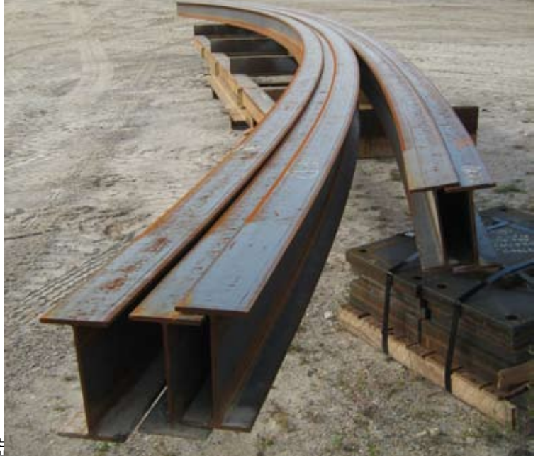
▲ Careful planning reduced the number of horizontally curved beams in the office wing to a minimum.

Green Mountain Steel Erectors, Inc., Bennington, Vt. (SEAA Member)