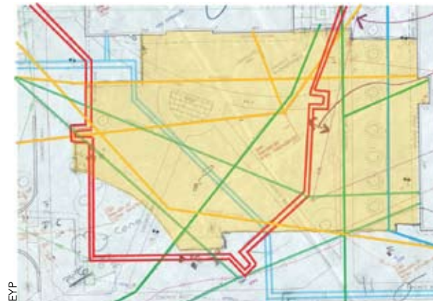
▼ Fig. 3: A multitude of utilities within the footprint of the building created challenges but resulted in a pleasant surprise.