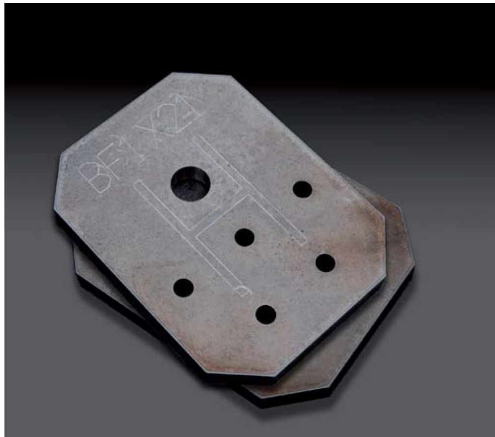
► An example of parts marked by the Ficep scribing system.

Unlike milling, plasma does not require a change in tooling. That is a benefit if you choose to forgo a stand-alone machine and use the same machine for coping and marking.