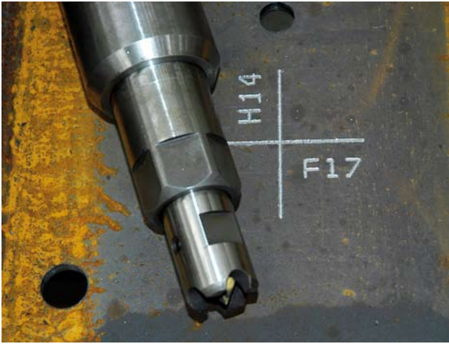
◀ Ficep milling tool and fit-up marking.

ing data from detailing software and creating from that an XML file for scribing.