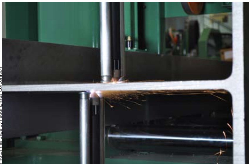
▲ Above, center and below: The PeddiWriter uses a plasma torch to mark the surface of the steel.