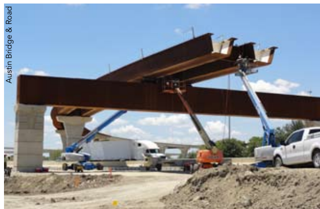
▲ Fig. 4: Steel box straddle bents were introduced to reduce the required spans of the superstructure over I-30.

These steel box straddle bents are considered fracture-critical and will require regular inspection. (TxDOT discourages the introduction of new fracture-critical elements on its projects.) The tub girder units on this project are also fracture-critical, but the additional effort to inspect additional elements on