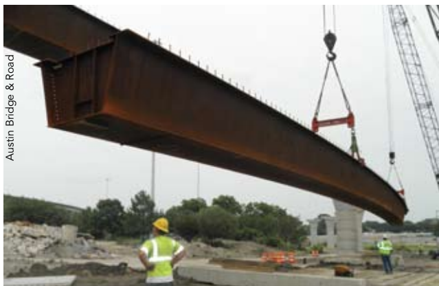
▲ Fig. 3: The contractor was able to bolt an entire span on the ground and lift it as one girder, eliminating the need for shoring towers.

time needed for erection. Figure 3 shows how the contractor was able to bolt an entire span on the ground and lift it as one girder, eliminating the need for shoring towers.