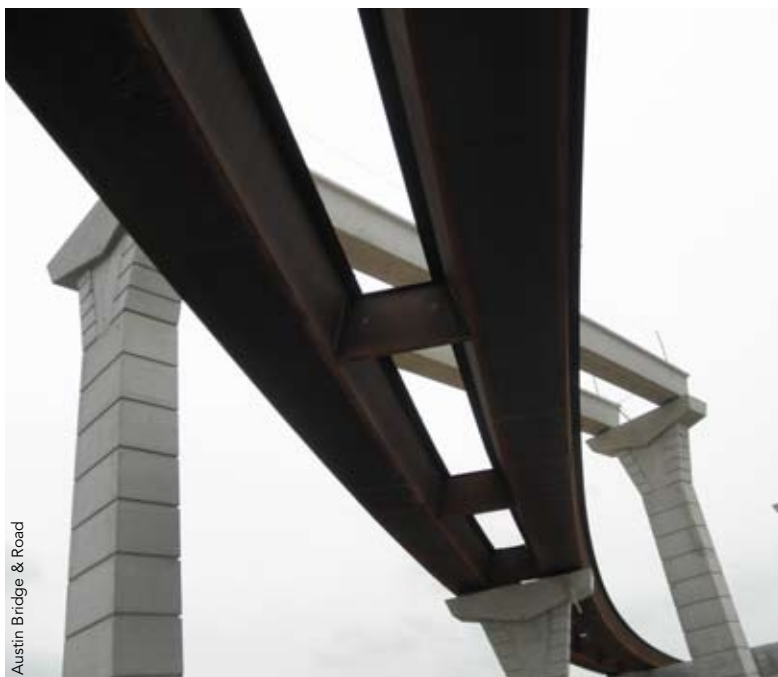
Austin Bridge & Road

Tub girders easily handle the long spans on a prominent Dallas-area interchange.