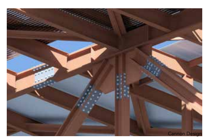
A truss connection as a Revit model...

When the new bridge building opens in May, Onondaga Community College students, faculty and visitors will have a new path across Furnace Creek Gorge, as well as a new music building surrounded on all sides—including below by natural beauty.