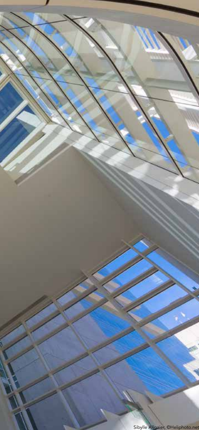
Sibylle Allgaier, ©Heliphoto.net