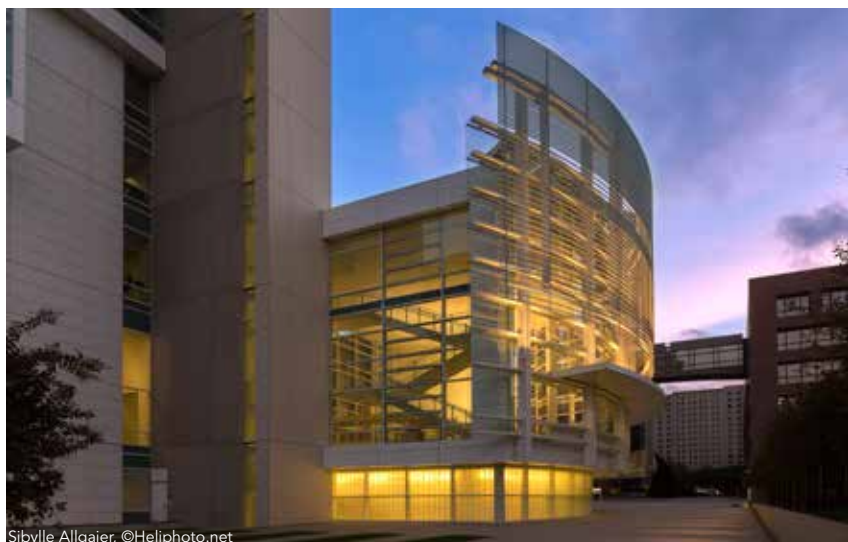
Sibylle Allgaier, ©Heliphoto.net