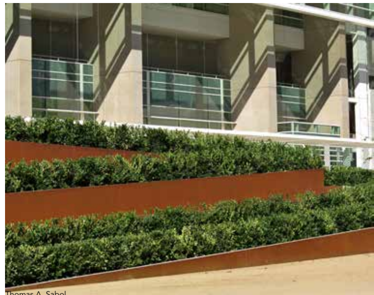
Thomas A. Sabol

Faced with these constraints, we encouraged the owner, the U.S. General Services Administration (GSA), to use a performance-based design approach as we felt it could be used to demonstrate that an all-braced frame lateral system exceeding the prescriptive building code height limits would be an effective seismic system. One of the primary motivations behind the use of performance-based seismic design recognizes that typical building code requirements may not be well-suited for atypical structures. Properly applied, project-specific design criteria can result in a better seismic performance because member proportioning better matches anticipated demand. Plus, the capital invested in a building designed using performance-based criteria will be more effectively deployed than is likely to happen with a conventionally designed building. In the case of this project, the final design, which ended up being based on the performance-based design criteria, was several million dollars less expensive than the dual system alternatives mandated by the building code.