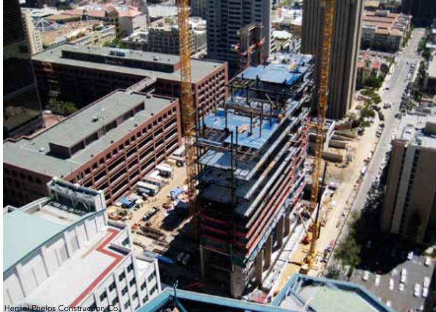
Hensel Phelps Construction Co.

Concrete-filled metal deck supported by steel wide-flange beams and columns resists the gravity loads; the beams are 24 in. deep and the girders are approximately 27