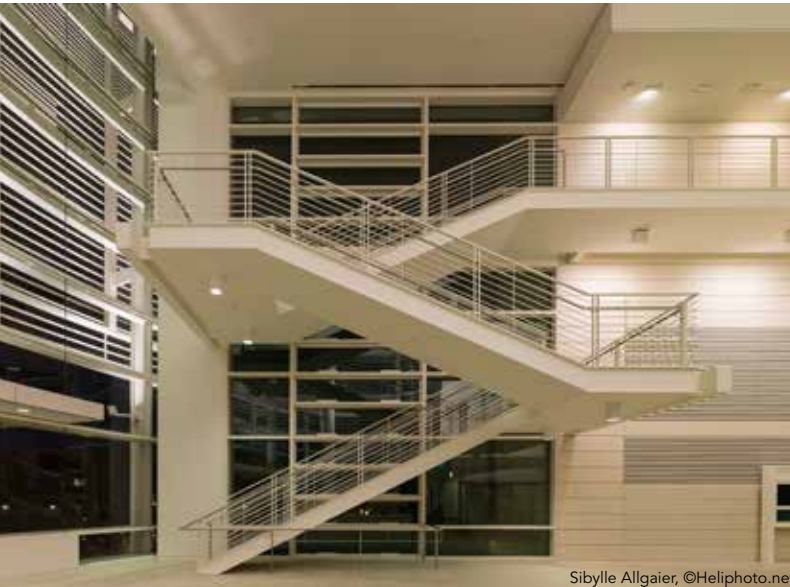
Sibylle Allgaier, ©Heliphoto.net

◀ An exposed structural steel stair in the entrance lobby floats between Levels 1 and 2.