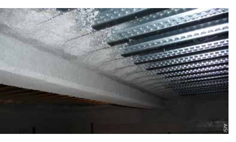
An unrestrained steel-framed floor specimen, before and after the fire test.