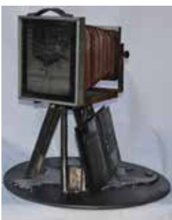
Memories of Steel

Visit www.aisc.org/nascc to view register and to view the advance program.