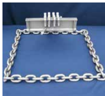
Get a Grip