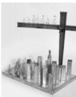
Lunch Atop a Skyscraper