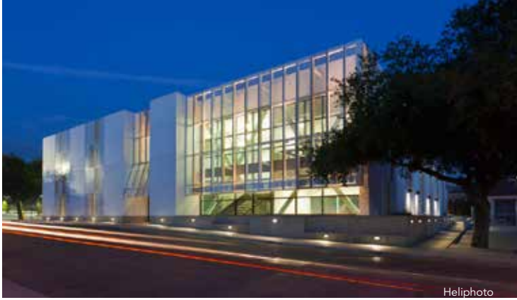
▲ West elevation at night.