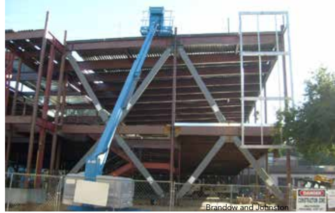
▲ West elevation, and BRBs, under construction.

Rather than using concrete fill over the metal deck at the mechanical well to reduce acoustical issues, raised concrete platforms were designed at the perimeter of the units to reduce the weight and, therefore, seismic impact. Additional steel beams were required between the main beams to support stem walls at the edges of the raised pads, and rebar dowels were welded directly to the steel beam flanges.