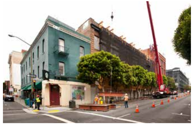
▲ The Battery, from the street.

tures, and the cantilever columns that support glulam beams at the roof transition to steel HSS8×4× 5 / 8 columns from the penthouse level to third floor via momentized steel splice connections to create the backspan portion of the cantilever. In order to achieve such precision and make sure the execution was flawless, Holmes Culley began doing concept work on the project in early 2009. Through close collaboration with FME Architects and BCCI, and working from an architectural layout standpoint, the team was able to determine where to locate the steel moment frames in parallel with the brick piers.