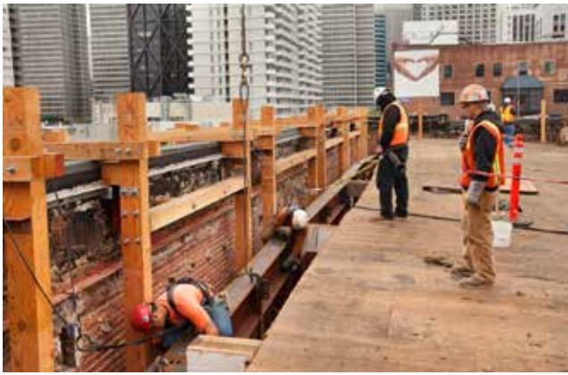
▲ Installing new steel.