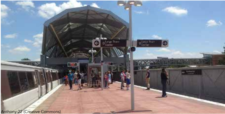
Anthony-22 (Creative Commons)