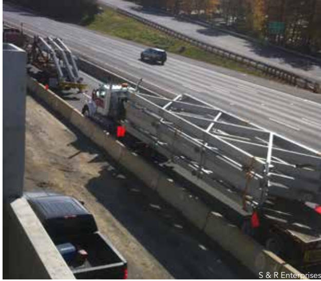
S & R Enterprises