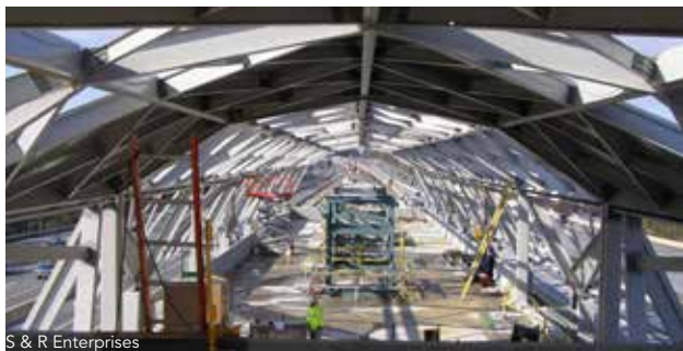
S & R Enterprises