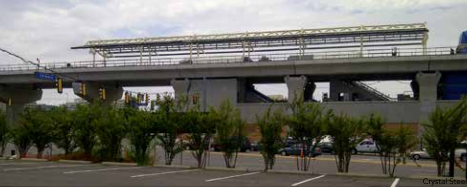
▲ ▼ Crystal Steel fabricated approximately 3,200 tons for Phase 1 of the Silver Line project.