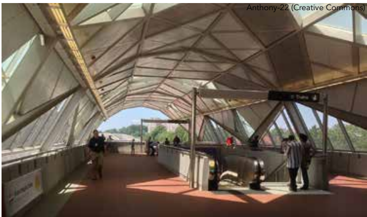
Anthony-22 (Creative Commons)