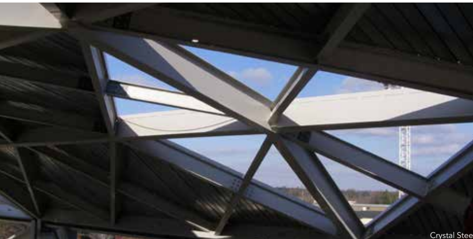
▲ Framing for a window in the Wiehle-Reston East station canopy. ▼ Steel "V's" at the McLean station.