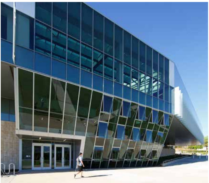
The facility features several substantial cantilevered floor areas, the longest of which extends nearly 60 ft.