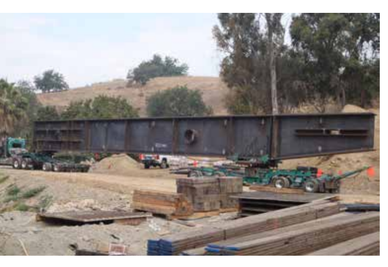
The long cantilevers are supported by a combination of two-story Vierendeel trusses and heavy steel plate girders at the roof. The heaviest steel plate girder is 9 ft deep, with a weight of approximately 82.5 tons.