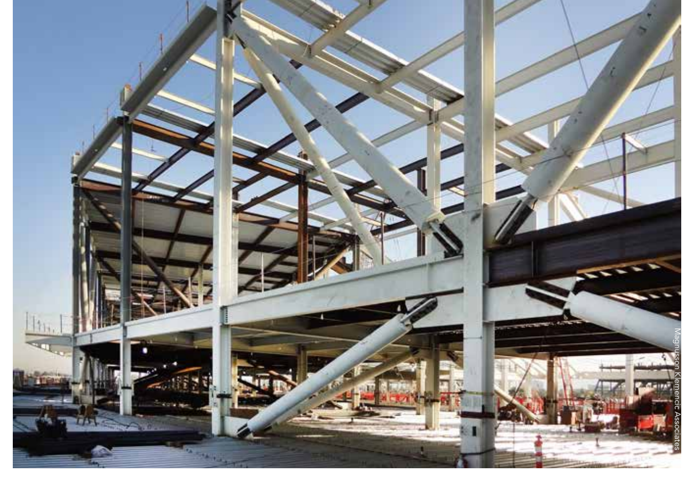
Levi's Stadium incorporates 529 BRBs, the first use of such a system in an NFL stadium.