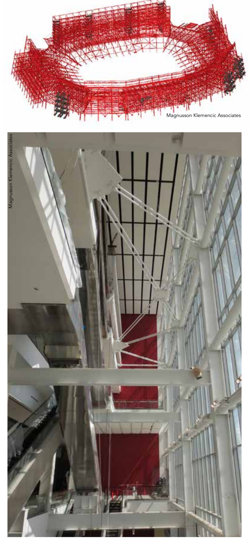
▲ In addition to football, the 1.9-million-sq.-ft facility is designed for soccer, concerts and other high-attendance events.

MKA agreed to phased delivery of the structural packages, with structural steel on the critical path, requiring that construction documents be completed in the middle of the design development phase of the project. To facilitate local permitting, MKA also proposed a combined peer review/plan check process to expedite a rigorous structural design review and permitting process. By splitting the stadium's structure into eight plan-check packages, MKA continued to engineer packages while others