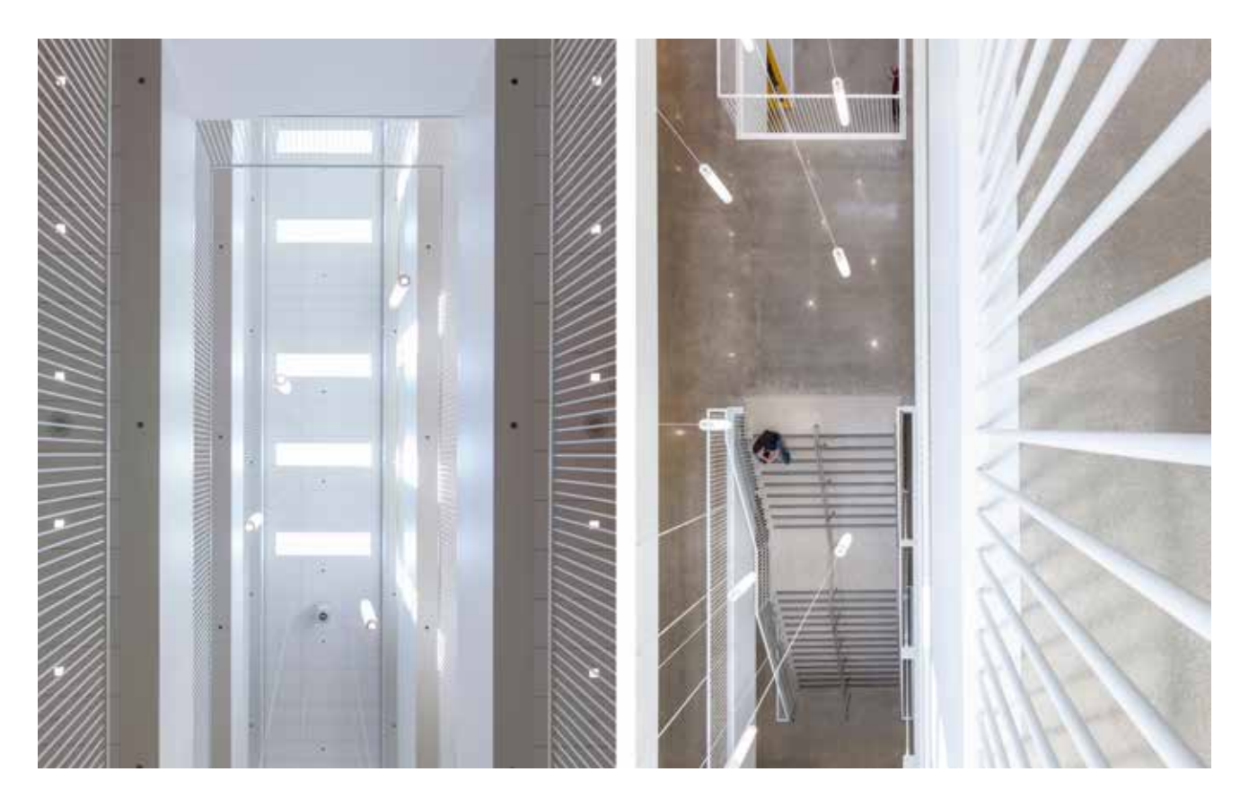
Looking up and down through the atrium.