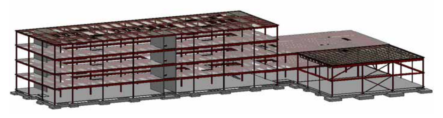
Overall 3D view of the structural Revit model.