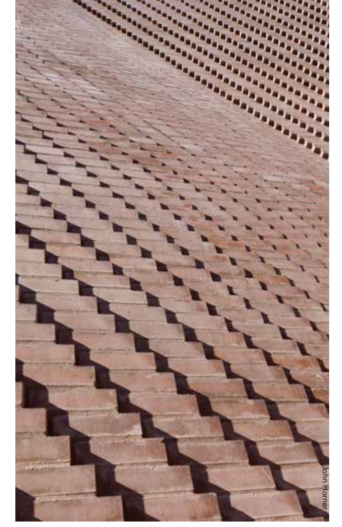
Looking up at the brickwork of the building's front entrance.