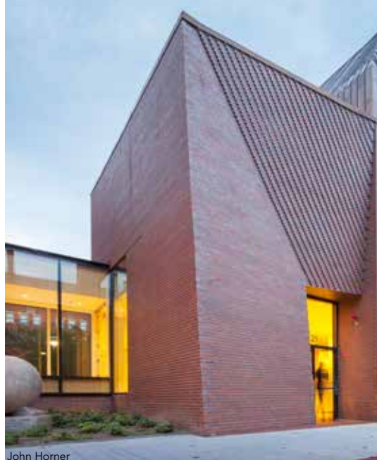
Planned live loads of 50 psf for new office space made it possible to add two additional floors to the existing two-story structure without overloading the building columns and foundations.

▲ To stiffen the building against wind loads in both directions, the team developed two special bracing systems that responded to both the new architecture and the existing framing.