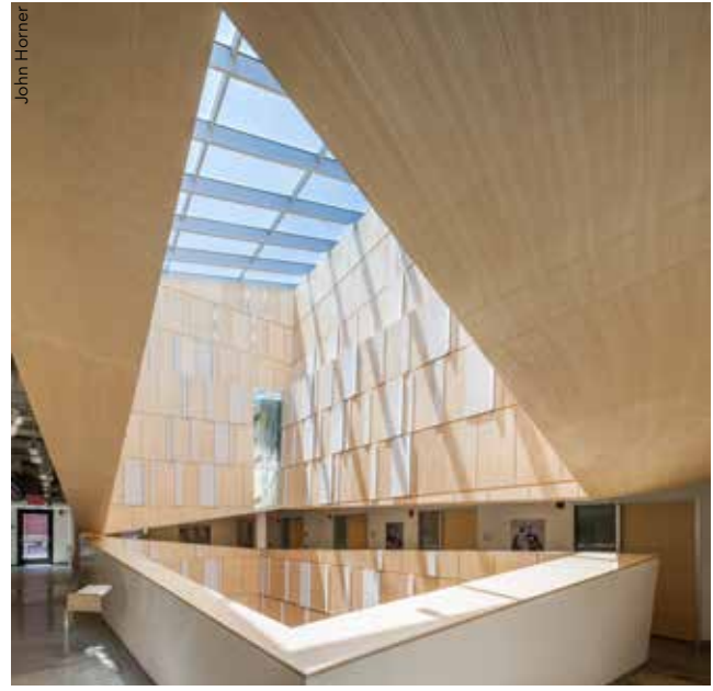
Two existing open bays at the center of the original penthouse floor/low roof form the basis for the light well, which extends up through the new fourth floor and roof.

moves required subtle detailing of relieving angles that varied on a floor-by-floor and wall-by-wall basis due to the stacked framing configuration.