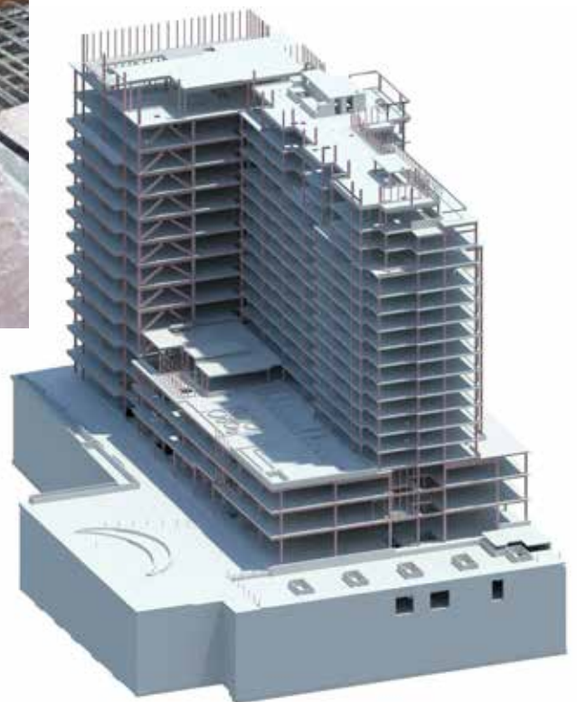
▶ A Revit model of Phase 1.