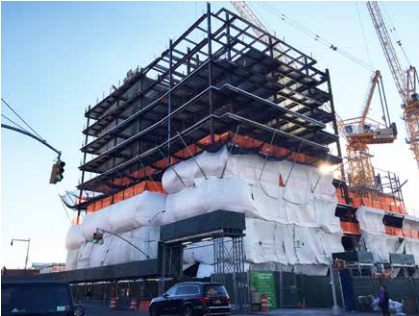
◀ Construction of the 11-story office tower.

This level of coordination, over a project with so many components and in a tight urban setting, is impressive but also expected for such a high-profile development at the heart of New York's largest and second-most populous borough. ■