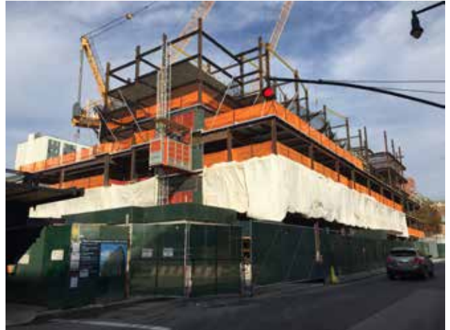
▲ Construction of the residential building.