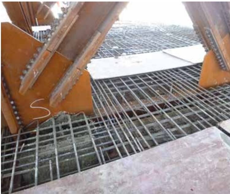
▲ A strap beam erected on-site.