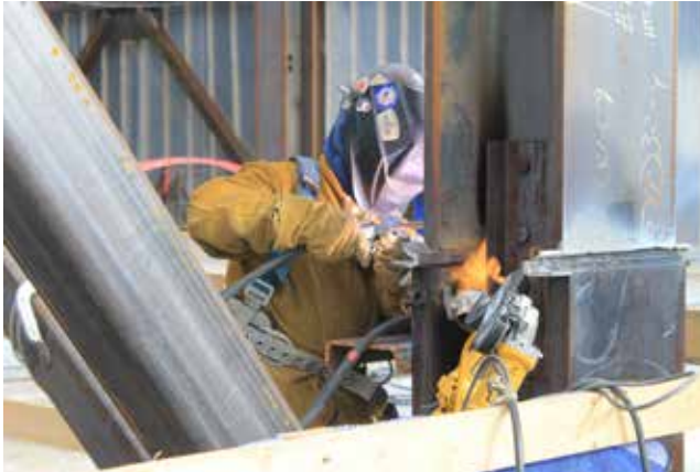
▲ Welding requirements have seen some changes in the new spec.

tions of tension members. Thus, shorter welds, as well as different length parallel welds, are permitted, but the resulting shear lag factor will be small and the strength of the member will be reduced accordingly. In addition, the specific situational limitations for fillet weld terminations, stopped short or extended, have been removed and replaced with a performance-based requirement that the termination does not result in a notch subject to applied tension loads. The weld also must not prevent deformation required to provide assumed design conditions.