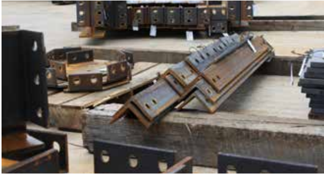
▲ The provisions for double angles and tees in flexure have been reorganized for clarity.