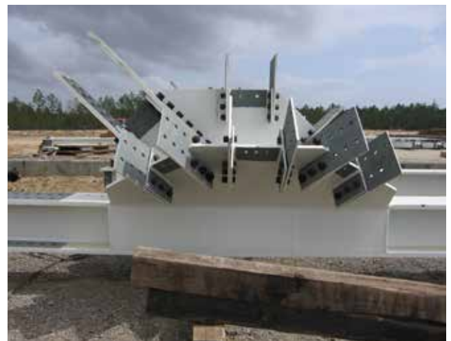
▼ The new version of the specification includes a handful of significant updates to bolted connections.

These are just some of the changes to the Specification and should not be thought of as the only ones that might impact a particular project. A complete review is highly recommended so that one is familiar with the new version when building codes that incorporate it are adopted. For additional information on the major differences between the 2010 and 2016 Specification , take a look at the 2016 NASCC: The Steel Conference presentation “An Overview: The 2016 AISC Specification for Structural Steel Building,” available at www.aisc.org/2016nasconline . ■