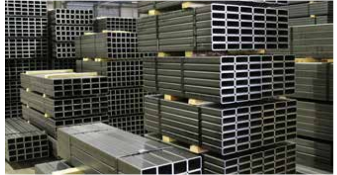
▲ ASTM A1085 and ASTM A1065 have been added to the 2016 Specification as approved HSS material standards.

The changes in determining compressive strength for members with slender elements have significantly altered the nominal compressive strength of select steel shapes (the difference for one such case is shown in Figure 1). Further information on the impact of this change and other affected shapes can be found in the third-quarter 2016 Engineering Journal article “Notes on the AISC 360-16 Provisions for Slender Compression Elements in Compression Members.”