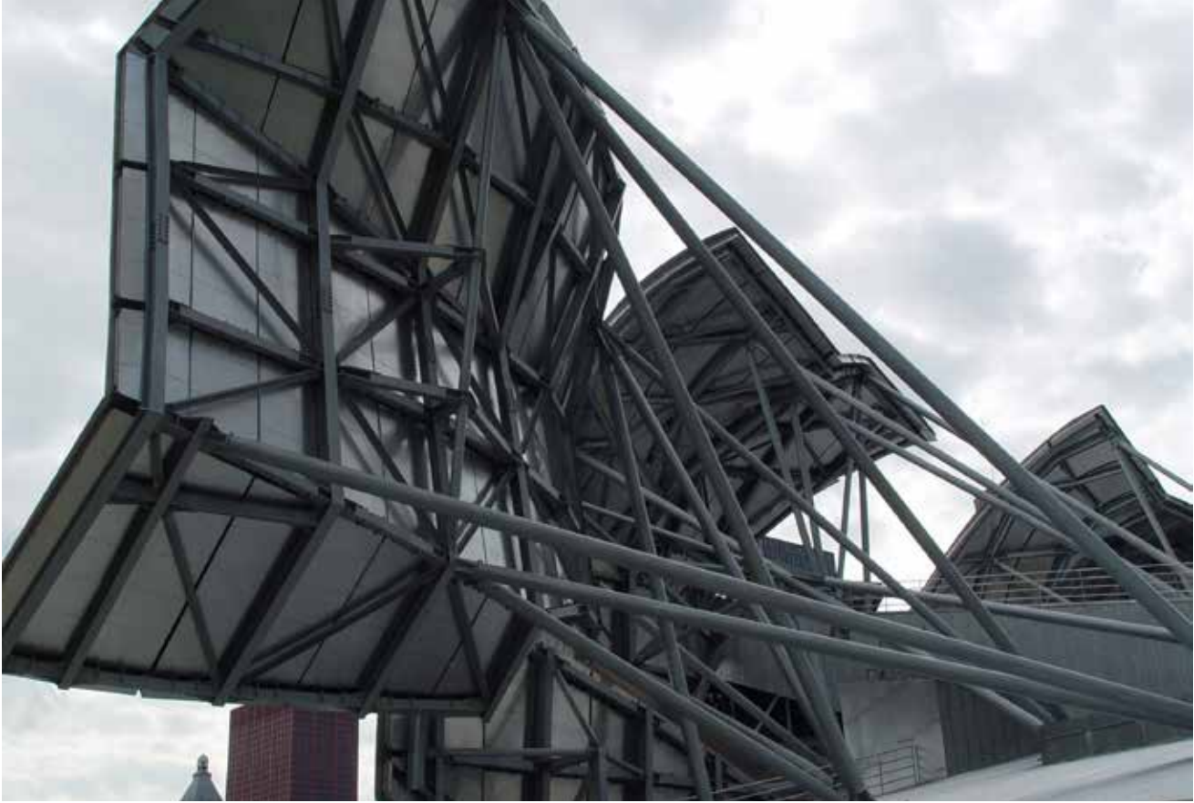
▲ Pritzker Pavilion: the structure behind the complex roof geometry.