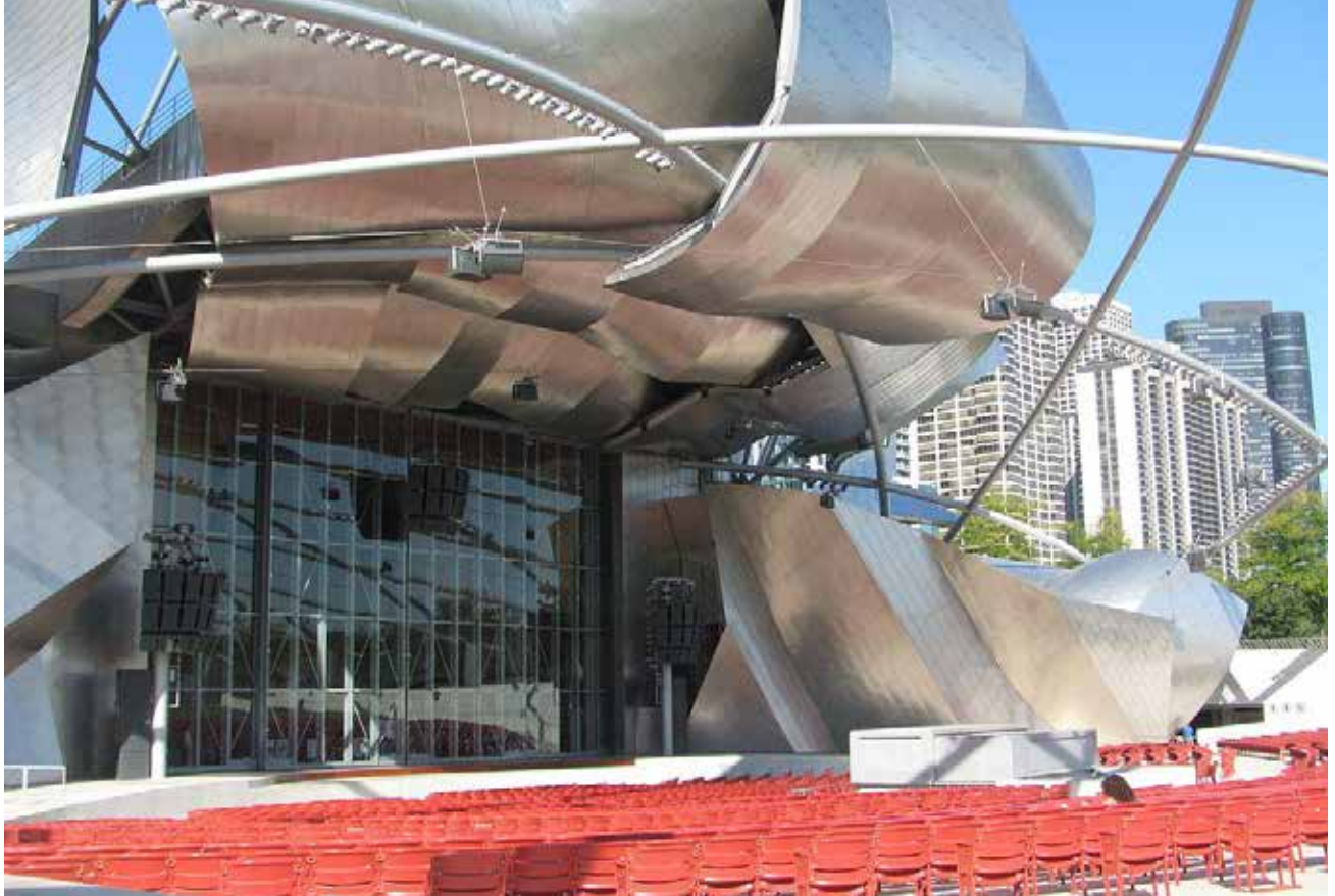
▲ Chicago's Frank Gehry-designed Pritzker Pavilion and its complex roof geometry.