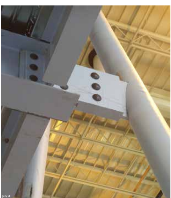
AESS connection of a floor beam to a truss diagonal.