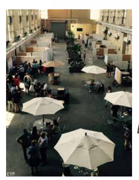
Student spaces within the C2 high-bay.

felt that it was in Lehigh's best interest to reinforce the low roofs as part of this work so that it can confidently repurpose these spaces in the future. The use and occupancy of the spine did not change with the new programming, and the proposed work resulted in only a very limited structural alteration. Therefore, it was not necessary to evaluate the spine to the same level as the high-bay wings.