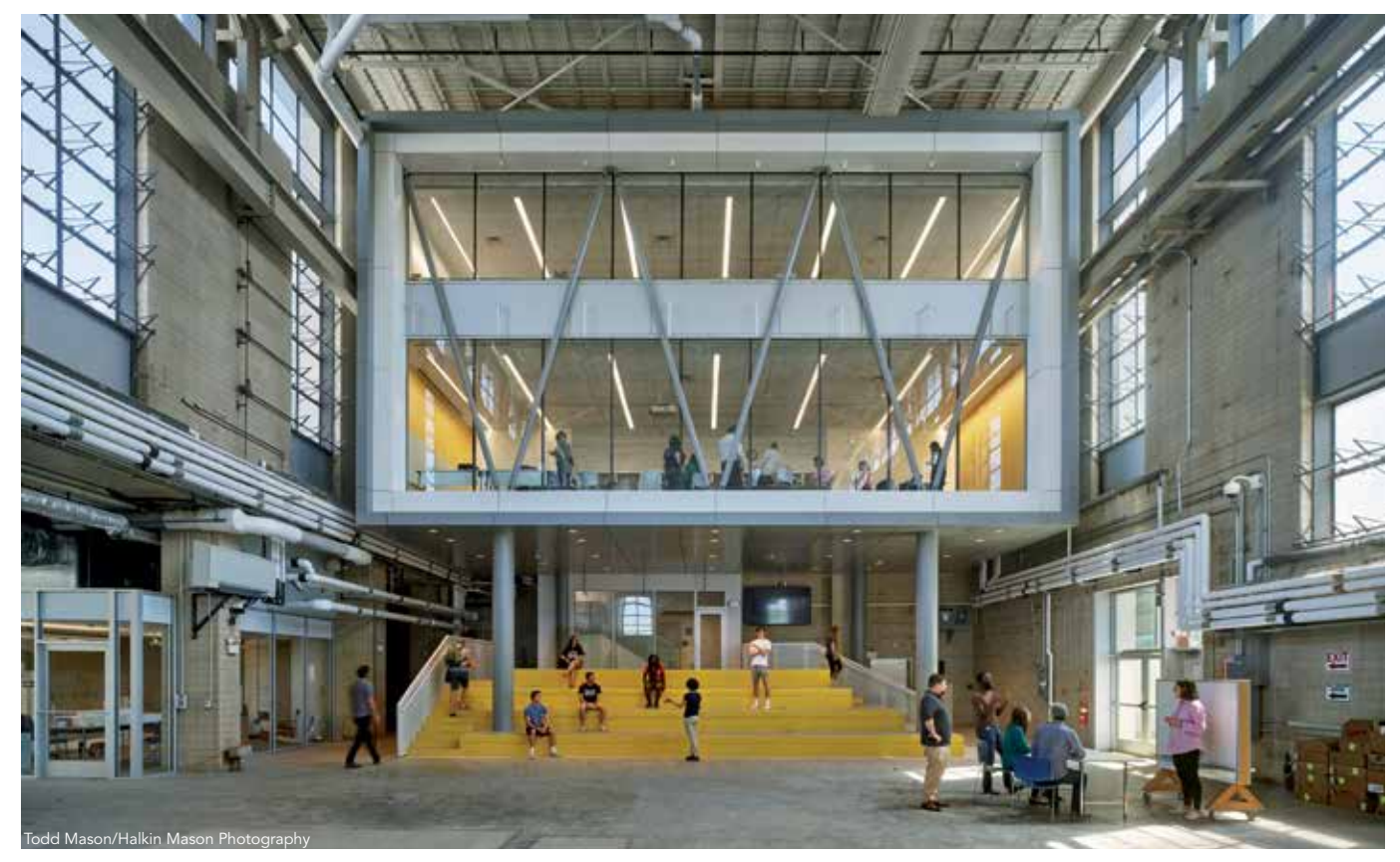
above: The completed C2 mixing box within the C2 high-bay.

Lehigh's new renovated research facility demonstrates steel's adaptability while also giving students and faculty an attractive, open space for learning and interaction.