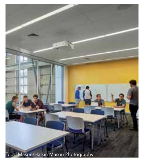
Occupants "inside the box" can look out into the high-bay space.