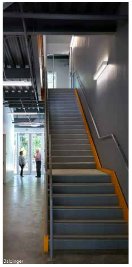
The steel-framed stairs, installed.