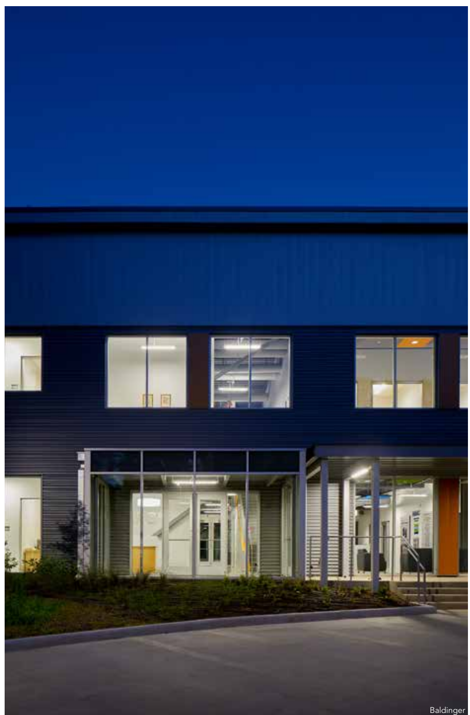
A whole-building life-cycle assessment was employed to optimize the structural framing system for HARC's new headquarters.