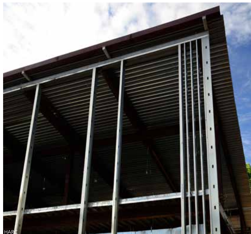
HARC is a not-for-profit research facility that provides analysis on energy, air and water issues in buildings.

A Houston research facility successfully implements a whole-building life-cycle assessment to reduce embodied emissions and push toward a "zero-carbon" building.