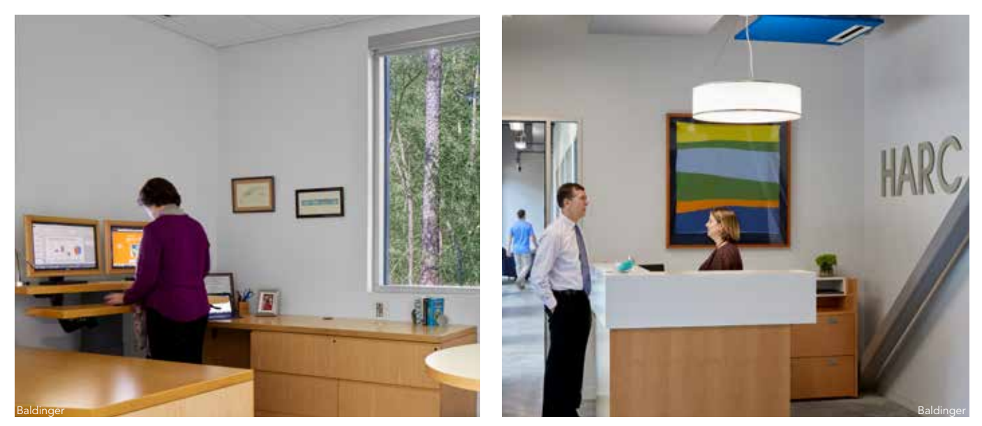
A whole-building life-cycle assessment was employed to optimize the structural framing system for HARC's new headquarters.

project's environmental impacts. It also provided lessons that can be employed by other teams wanting to use WBLCAs to minimize the impacts of their designs.