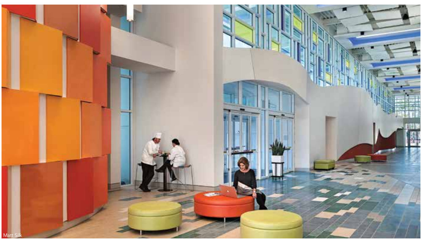
above: Steel framing facilitated long spans, resulting in a large amount of glazing that allows much of the interior to be bathed in natural light.