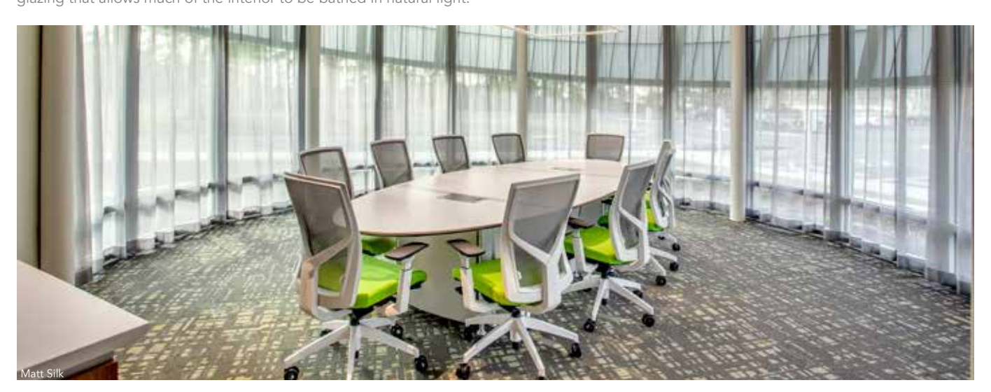
below: The interior of the circular conference room.