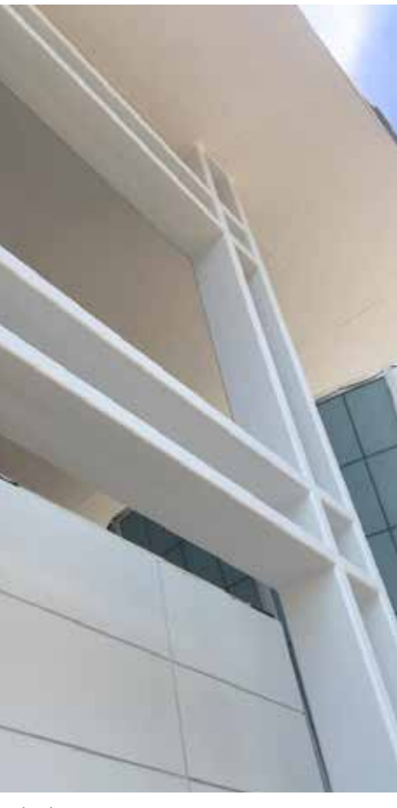
Entrance framing, before and after coating was applied.

The circular demonstration kitchen contains a long, curved window requiring a curved steel lintel, which in turn had to support a splayed series of vertical sunscreens on the window, using steel extensions for braces.