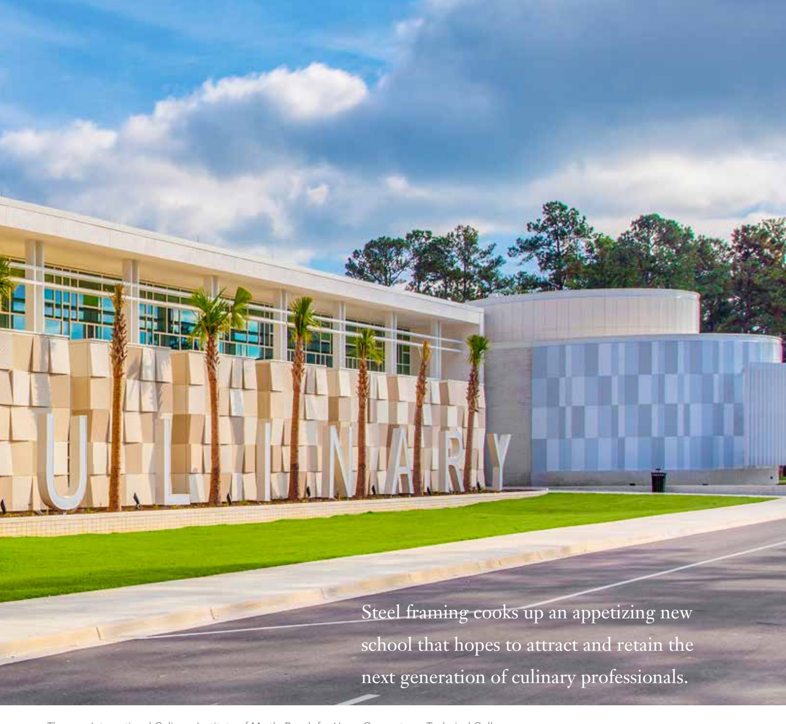
The new International Culinary Institute of Myrtle Beach for Horry Georgetown Technical College.